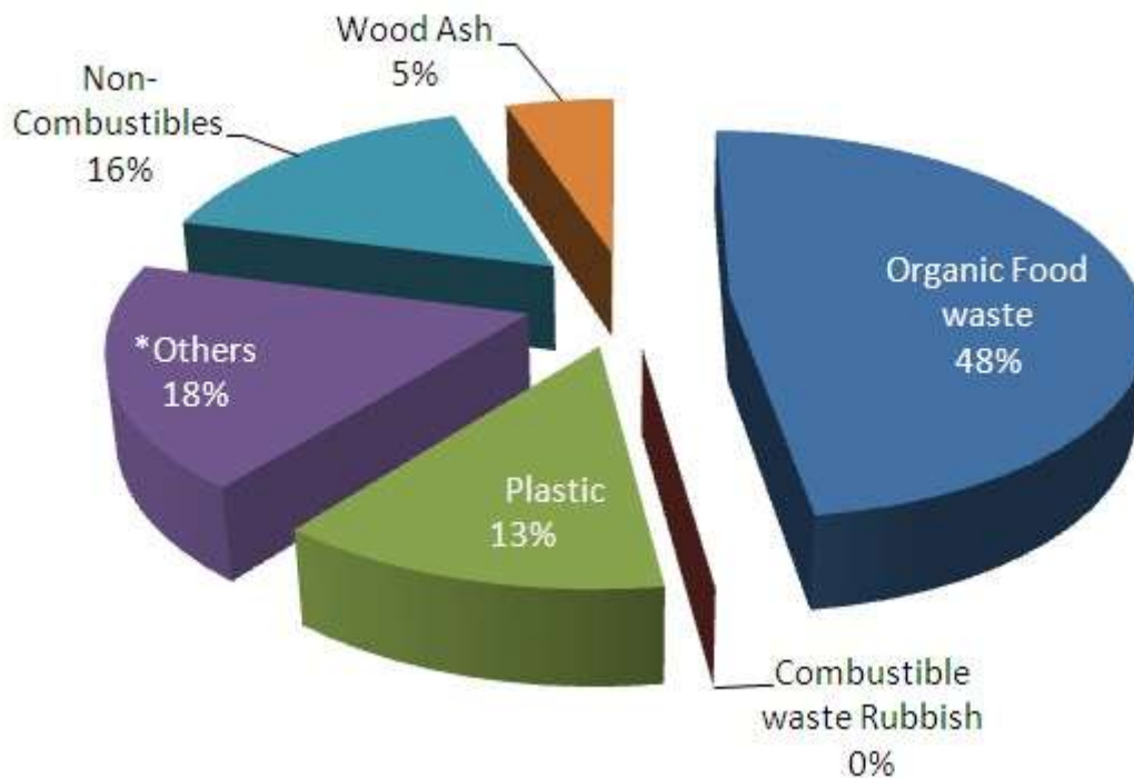
Figure 1: displays the many categories of solid waste produced annually.

uses for agricultural waste, including farm trash, waste seeds, and waste seedlings. But intelligent agricultural management will undoubtedly strengthen our economic structure. In a graphical format, Figure 1 displays the many categories of solid waste produced annually.