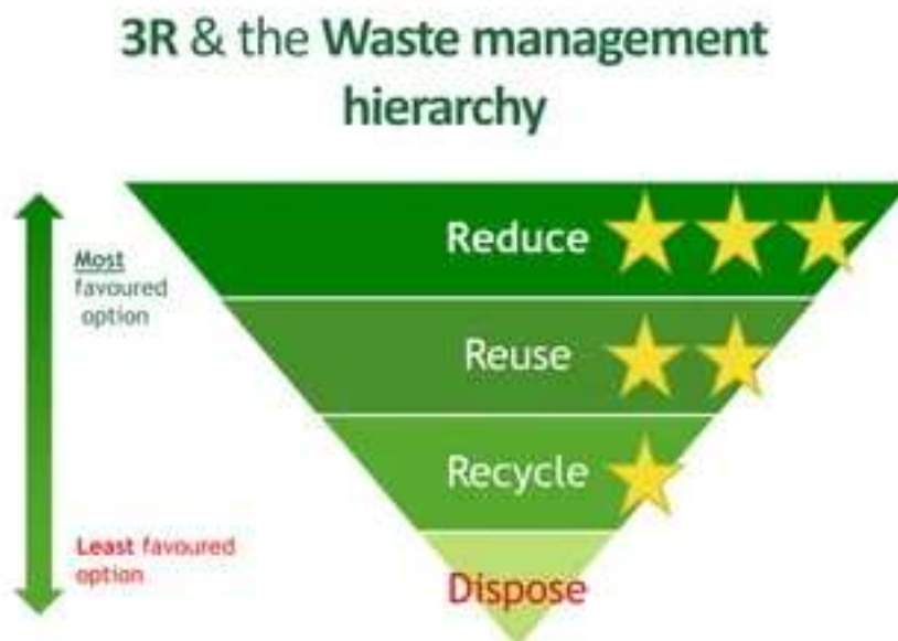
Figure 3: Describes the 3Rs Hierarchy

The 3Rs Hierarchy is displayed in Figure 3 from the least preferred option to the most preferred one.