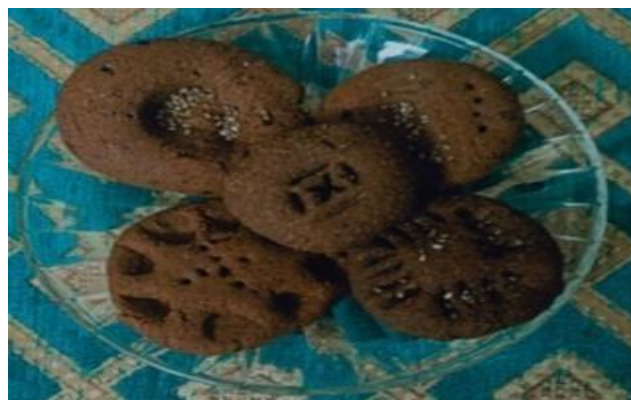
Figure 1. Fiber rich biscuits.