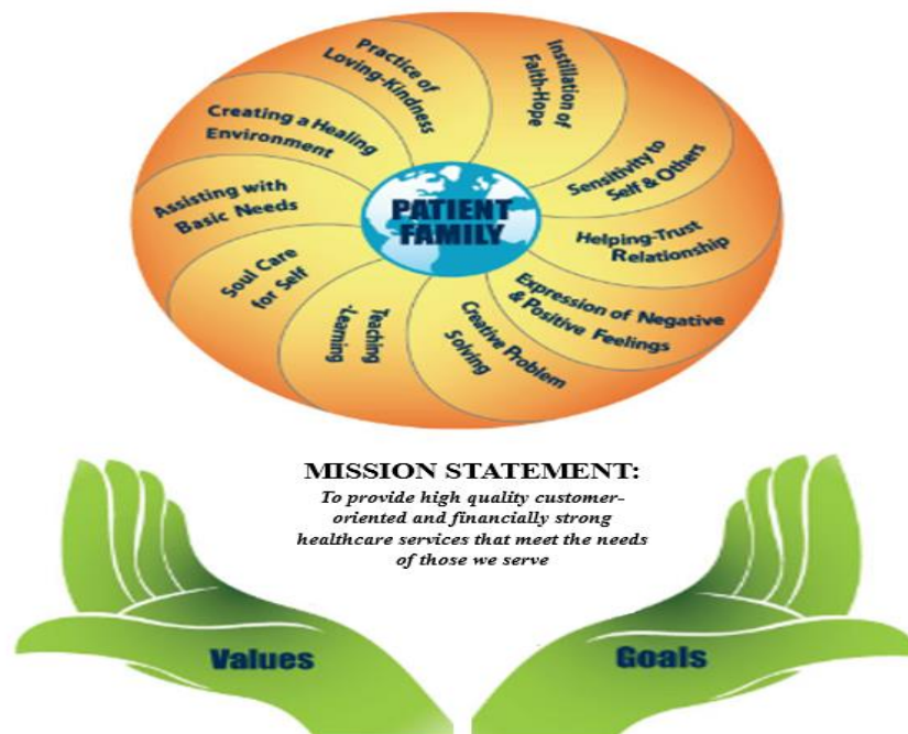
Figure 3. The theory of human caring.

Nurse-related barriers. Because nurses don't know the proper dosage for opioids or know how to deliver them, patients' pain is still not adequately addressed in hospitals. The most significant obstacles to nurses implementing pain treatment, according to a number of studies [6], include knowledge gaps, insufficient pain assessment, and unwillingness to administer opiates. The staff nurses noted a number of challenges, such as prescriber attitudes and beliefs, dosage selection, errors in prescribing, and limited knowledge of opioid preparation. In order to effectively advocate for their patients' needs in pain management, nurses are in a unique position. Unfortunately, due to time constraints, a lack of education and experience, and challenges with pain assessment, nurses might not be equipped to speak out for patients.