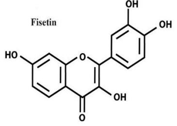
Figure 1. Fisetin Chemical Structure

with many anticancer receptor sites, and have anti-inflammatory effect by inhibiting inflammatory cytokines (Figure 1). However, its limited cellular absorption and bioavailability restrict its therapeutic development (2,3). Various pharmaceutical drug delivery strategies have been reported to overcome this problem. Liposomes, Polymeric micelles, Trans and Binary ethosomes, Self-nano emulsions, Polyvinyl alcohol and poly (lactic-co-glycolic acid) nanoparticles have been reported (4-10). Cubosome nanoformulation of fisetin was prepared because of its simple procedure, use of very few formulation ingredients, increased water solubility and bioavailability, and targeted drug delivery effect (11-14).