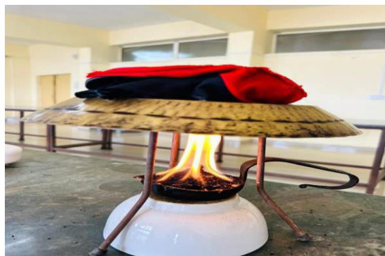
Fig. 2:Light the lamp and put the inverted copper plate