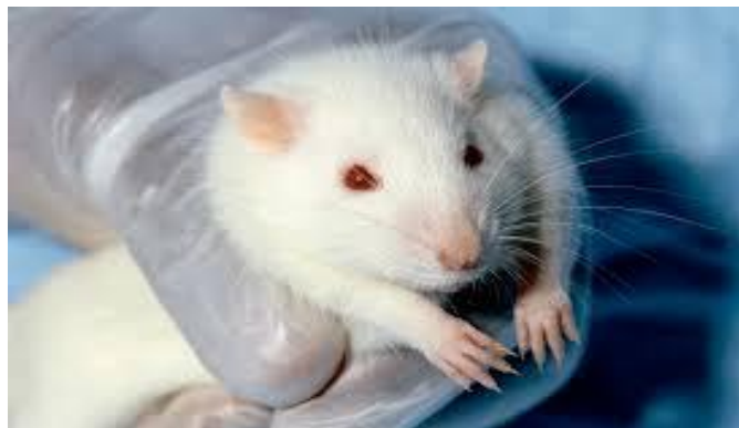
Figure 1: Wister Rat

Individuals have long depended on plant cures, either entire or in extract structure, to ease many ailments. A portion of the numerous restorative mixtures got from these plants incorporate the narcotic pain relievers morphine and codeine as well as analgesics, cardiotonics, antineoplastics (vinblastine and taxol) and antimalarials (quinine and artemisinin) [3]. Restorative plant drug research is empowering the chase after new and significant leads in the fight against various pharmacological targets, including malignant growth, cardiovascular sicknesses, neurological problems, wilderness fever, and other comparative circumstances. Ongoing examination has demonstrated the way that plants can give a better approach to make bioactive ordinary blends. The development of special and on a very basic level different optional metabolites is the result of their long history of progress and transformation in light of ecological elements, microorganisms, bugs, and different animals [4]. They have been utilized as a fundamental wellspring of helpful mixes in early drug research due to their ethnopharmacological properties.