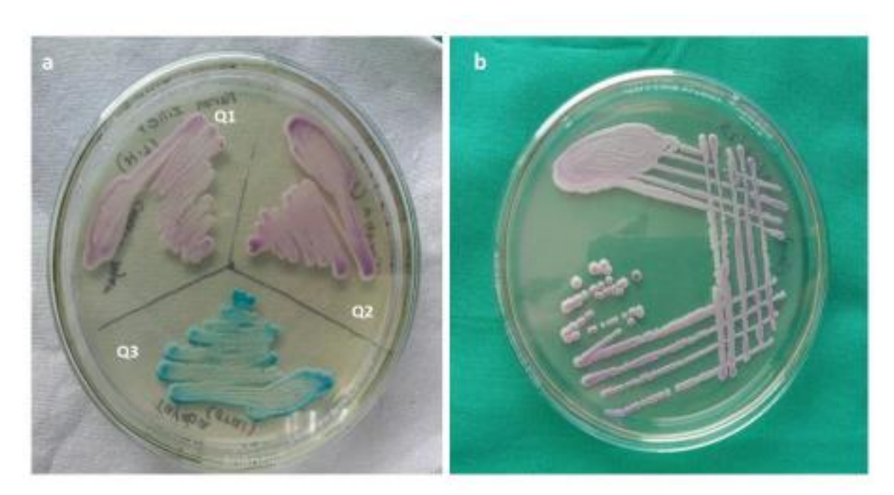
Figure 2a. Q1 and Q2 C. krusei forming purple colour fussy colonies. Q3 : Growth of C. albicans forming light green colour colonies