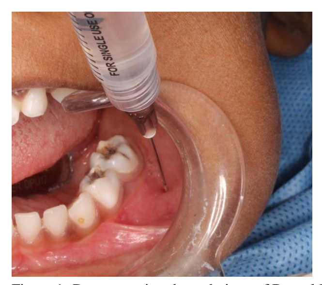
Figure 1- Demonstrating the technique of Buccal Infiltration

Considering \alpha =5% and power of 90%, the sample size of 33 patients was calculated using G power [22]. Given its a split mouth trial, with allocation ratio 1:1, left and right sides were divided into two groups. Left side or Group A was given buccal infiltration[Fig-1] and children undergoing pulpotomy on right side or group B was given 90 degree injection technique[Fig-2].