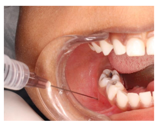
Figure 2- Demonstrating the 90 degree Injection technique