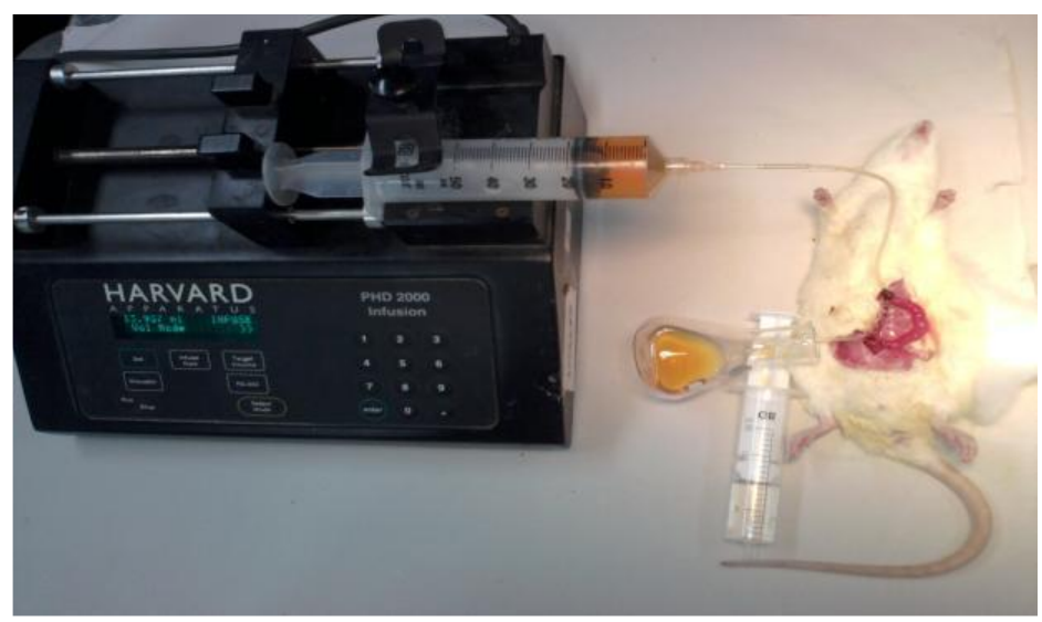
Fig. 1: Experimental SPIP Model