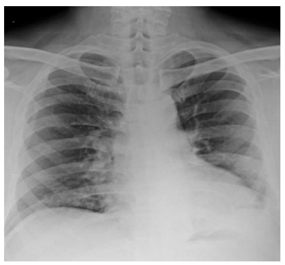
Image 4- Current Chest radiograph of the patient showing no recurrence.

KEYWORDS: Bochdalek hernia, Congenital Diaphragmatic hernia, Posterolateral hernia.