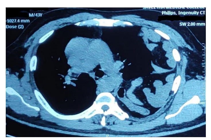
Image\ 2-Mediastinal\ window\ of\ CT\ chest\ showing\ the\ Herniation\ of\ abdominal\ contents\ into\ thoracic\ cavity.