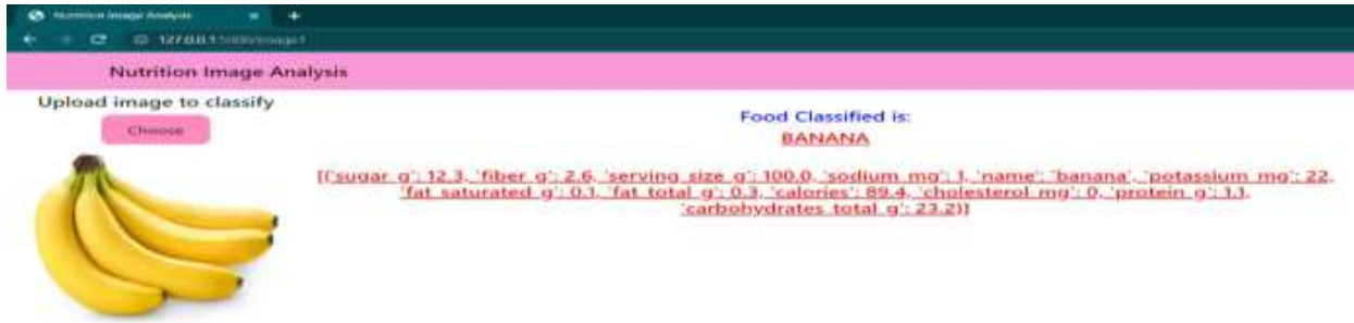
Figure 2: Analysis result of Banana Fruit

The above figure 3 result shows the analysis of banana fruit that contains nutrients as follows sugar -12.3 g ,fiber-2.6 g,sodium-1 ,potassium-22 mg ,fat 0.3 g ,cholesterol-0 mg, protein-1.1 g and carbohydrate-22.2gm. This result helps to know the nutrient content of apple and suggest the fruit for proper dietary system.it also helps to suggest fruit for all type of people to maintain their health inproper manner.