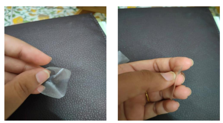
Figure 4 Both pictures are 3D printed orodispersible film 5. 3D Printer, Design and Printing Parameters

In this study, the syringe extrusion 3D printer developed by the 3 Fce Tech was used to fabricate the 3D-printed ODFs.3D printer in which an extrusion nozzle can move in an X and Y axis and also on separate building plate on a Z-axis while printing layer-by-layer for 3D structure generation to prevent vibration on the sample, This customized syringe extrusion 3D printer is based on a core-XY. For précised deposition, a customized extruder was designed and built in-house which is syringe-based for the project. The syringe extrusion 3D printer was controlled by a laptop or system and a user interface on the printer. In Figure, the syringe-based extruder used a stepper motor to move a plunger of a 10 mL syringe via a direct lead screw drive. After an object is designed using