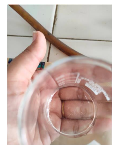
Figure 2 After sonication Process