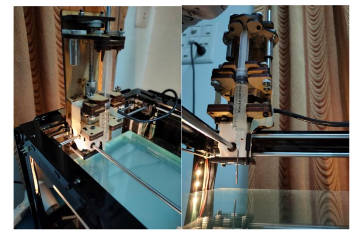
Figure 3 Semi-solid extruder(Pressure-assisted microsyringe) from two angle