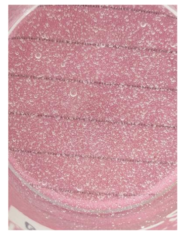
Figure 1 Initial Process of formulation