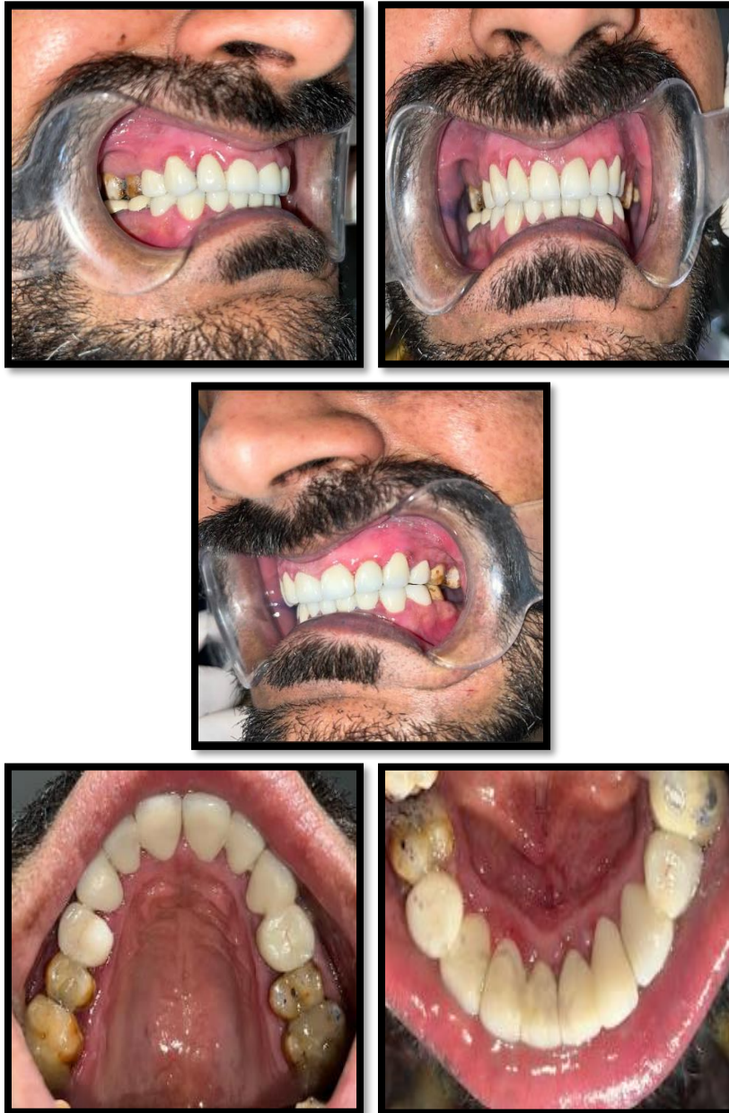
FIGURE 6- FINAL CEMENTATION

After the coping trial was done, the porcelain layers were added to the zirconia coping. On the final visit, the occlusal evaluation was done in centric and eccentric positions and all sixteen zirconia crowns were cemented with resin-modified glass ionomer cement following proper bonding procedures. (Figure 6)