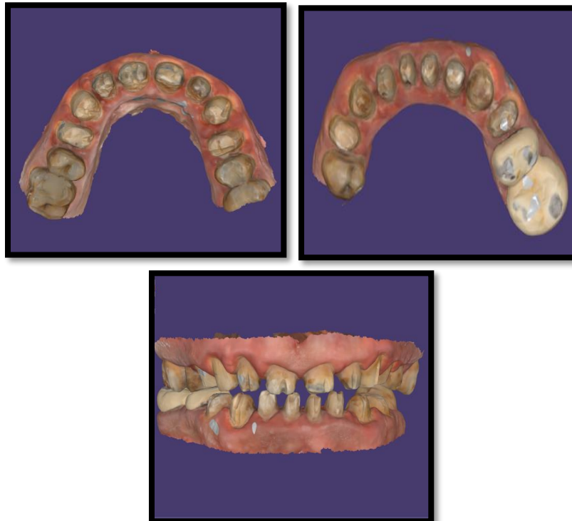
FIGURE 3- JAW SCANS

Subsequently, maxillary and mandibular arch scans were made using an intraoral scanning device (Medit i700), and the scanned data obtained was exported electronically to the digital lab using Exocad DentalCAD software (Figure 3).