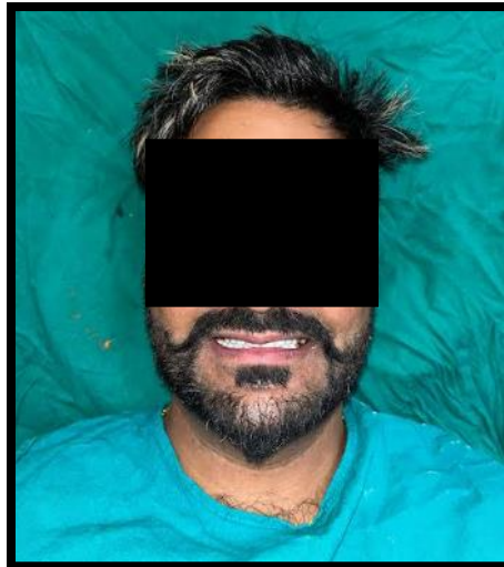
FIGURE 7- POST-OPERATIVE