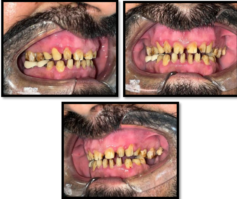
FIGURE 2- INTRAORAL VIEWS AFTER REMOVAL OF PFM BRIDGE

Fixed dental prostheses were removed in both upper and lower arches according to the treatment plan (Figure 2) and, the patient was referred for complete oral prophylaxis.