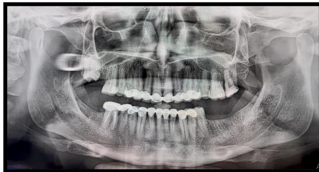
FIGURE 1- ORTHOPANTOMOGRAM REMOVAL OF PFM BRIDGE

Intra-oral examination showed fixed dental restorations from 14 to 24 and from 34 to 46 with generalized marginal gingival inflammation. The patient was also diagnosed as partially edentulous with respect to 17, 36, 37, and 47. Radiographic examination revealed an erupting 18, endodontically treated 46, and the rest of all teeth were vital. Multiunit fixed dental prostheses can be seen on orthopantomogram from 14 to 24 and 34 to 44, and separate two-unit fixed prostheses on 35 and 36 (Figure 1).