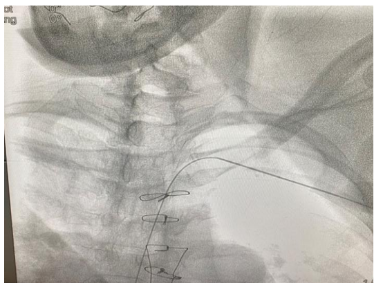
Figure 3: Subclavian vein puncture.<sup>4</sup>