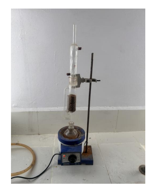
Fig.2. Soxhlet Appratus

attached to a round-bottom flask. Next, methanol is added as a solvent from the top of the condenser, which is attached to the upper side of the thimble to a round-bottom flask and placed onto a heating mantle. Finally, the soxhlet extractor is attached above the flask, followed by a reflex condenser that has cold water entering at the bottom and exiting above the extractor.Using solvent ethanol, for extracting the phytochemicals/phytoconstituents.