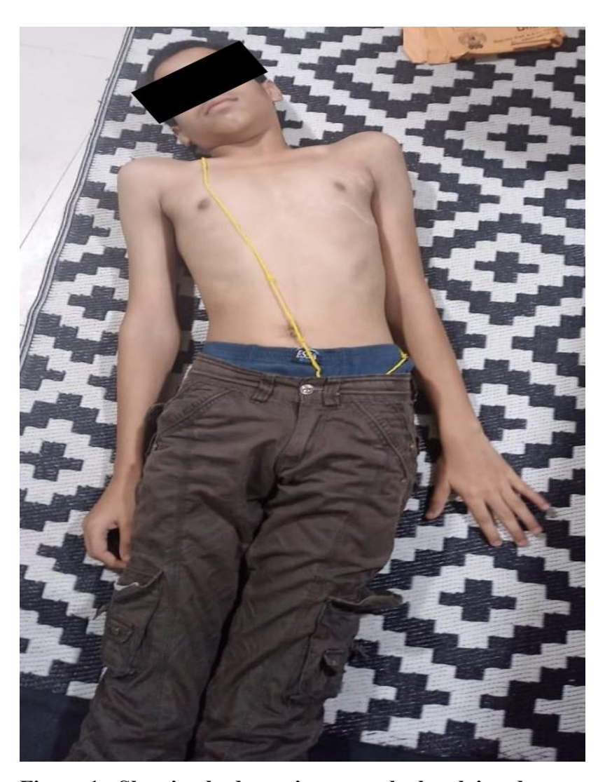
Figure 1 : Showing body getting curved when lying down

After confirmation of diagnosis, the disease was explained to patient and carrier giver and start a treatment accordingly with NSAIDs, Antacids, Antioxidants, Multivitamins and physiotherapy.