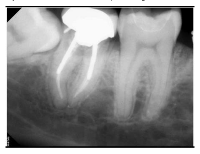
Figure 5: Fifth case used for the questionnaire.