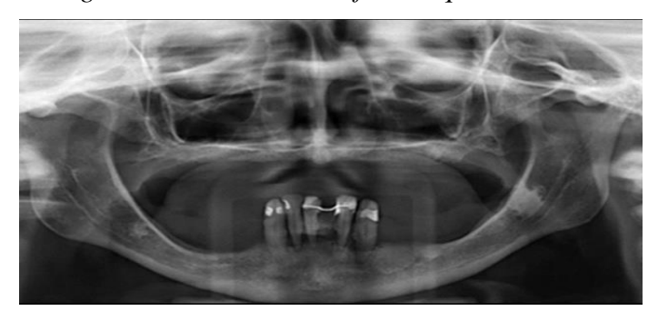
Figure 2: The second case used for the questionnaire.