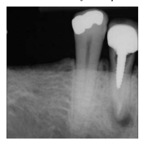
Figure 4: Fourth case used for the questionnaire.