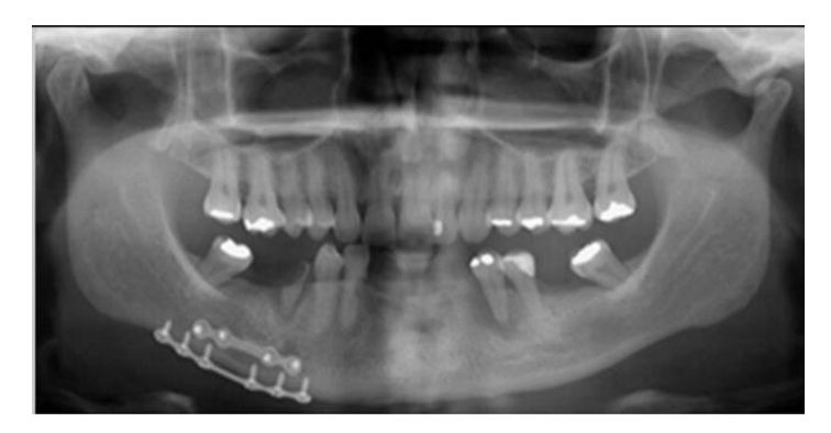
Figure 3: Third case used for the questionnaire.