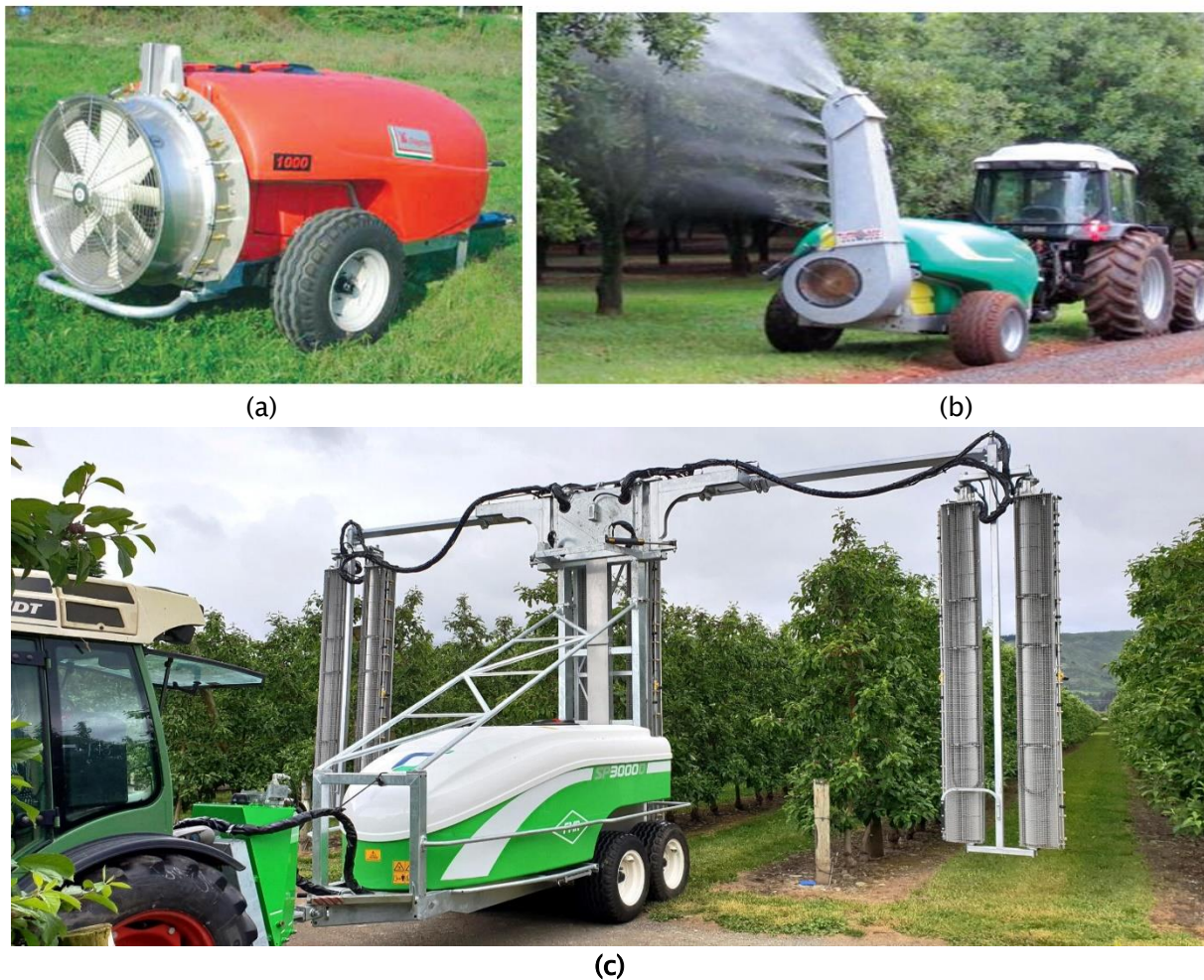
Figure 3. Air-assisted sprayers; a) Axial fan type, b) Centrifugal fan type, c) Crossflow/ tangential fan type

The qualities of this sprayer include high air rate and consistent discharge. It can function in the harshest conditions and can even withstand increased pressures and contaminated air (Thorat & associates, 2022). When using the radial discharge type, the fan draws air from behind the sprayer and lets it out in two directions: one direction, 90 degrees away from the fan, and the other, 180 degrees, spraying the canopies on each side of the sprayer. One drawback of conventional airblast sprayers is that they release air in a 180-degree radial pattern surrounding the fan outlet, including the area at the top without a canopy. Not only is there a substantial amount of air created trash, but it also contributes to loss of pesticide applied and results in excessive spray drift problems that are associated with airblast sprayers. (Ozkan, 2022).