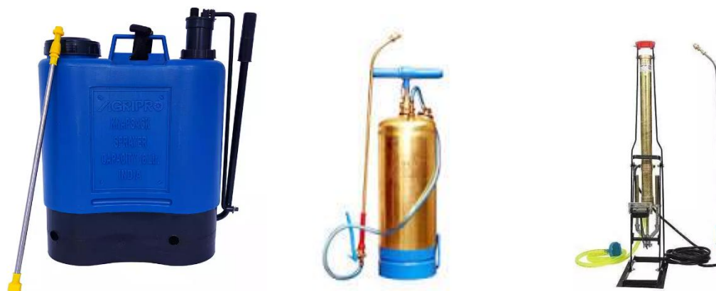
Figure 1. a. Knapsack Sprayer b. Hand compression sprayer c. Foot Sprayer

Since the sprayer lacks an internal tank, it is necessary to use an external container or storage device to hold the spray liquid while keeping the suction hose strainer submerged. Its adaptability and field capacity are increased by the two discharge line provisions. Being a positive displacement pump, the plunger pump generates high pressure to propel spray liquid farther when paired with an appropriate boom. The vast area coverage and high spray volume of this sprayer are its advantages.