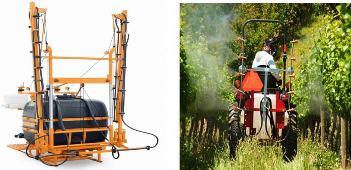
Figure 2. Vertical Boom Hydraulic sprayer

Field crop sprayers, such as those for maize, soybeans and wheat, and vertical boom hydraulic sprayers, share a lot of design similarities. The primary distinction is that field crop sprayers have a horizontal boom, whereas vineyard and orchard sprayers have a vertical boom. Higher spray pressure is another feature of hydraulic vineyard and orchard sprayers that aids in allowing droplets to pass through the dense grapevine canopy. However, even at higher pressures, the hydraulic sprayers' droplets are unable to efficiently reach the interior of the canopy.