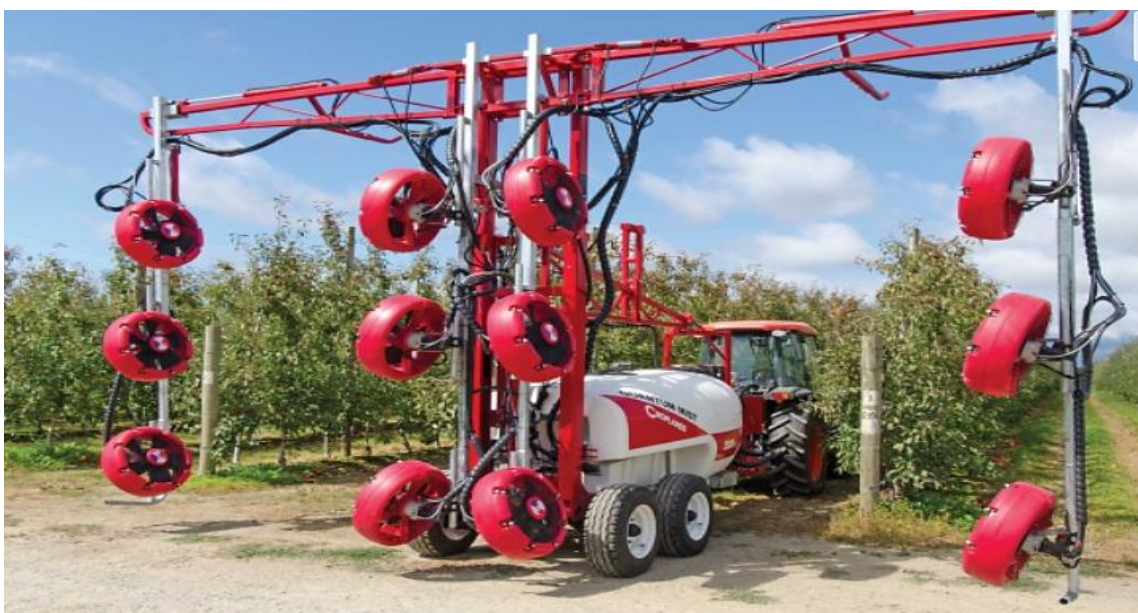
Figure 7. Air-assisted sprayers with multi-head fans

Two rows can be sprayed simultaneously using the air-assisted sprayers with multi-head fans (Fig.7). Many small axial fans powered by hydraulic or electric motors are used by the majority of producers of these sprayers. These fans use hydraulic nozzles to direct a jet of air. Operators can change the size of the droplets by varying the system pressure or nozzle size. As seen in Figure 8, each fan typically has six to ten recessed nozzles. In order to decrease spray drift and ground deposits and increase uniformity of spray deposition and coverage, the fans can be changed based on the canopy's angle, height, and width. Instead of using all four fans during the early season, two fans that are diagonally opposed are used. Fan speed controllers that are separate from the tractor hydraulic system are installed in the cab of some manufacturers' tractors. Operators may compensate for being upwind or downwind and modify fan speeds for varying canopy conditions thanks to this separate control.]