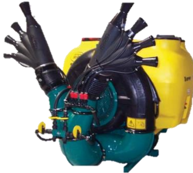
Figure 9: Pneumatic air shear sprayer