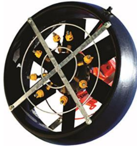
Figure 8. Fan with 8 nozzles