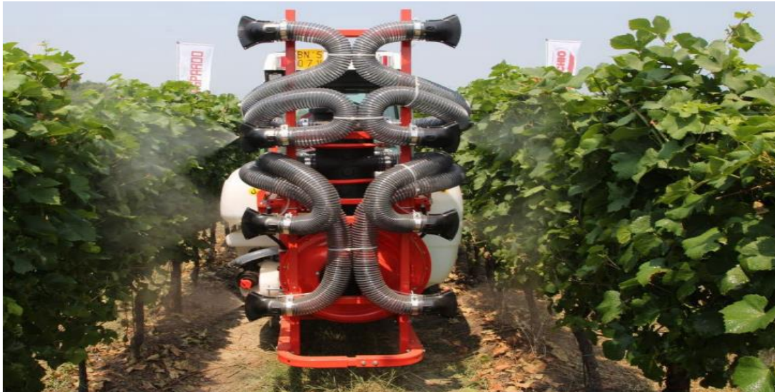
Figure 5. Sprayer with adjustable nozzles