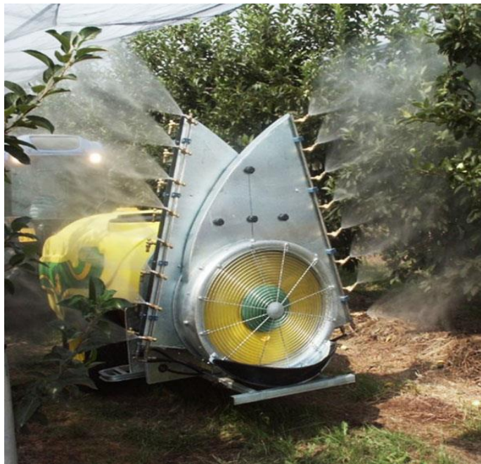
Figure 4. Tower sprayer

Fans that create a high-speed, low-volume air stream through corrugated tubes are typically seen in adjustable spout sprayers. Nozzles can be positioned on the side of a narrow, elongated manifold that is connected to the corrugated tubes, or they can be found inside spouts where the air exits the tubes (Figure 5). The ability to precisely and flexibly guide the spray towards the canopy or even a specific area of the canopy that has to be protected against specific insects or illnesses is the main benefit of these kinds of sprayers. It is possible to change the nozzle setup's angle and spout height (up, down, forward, and backward).