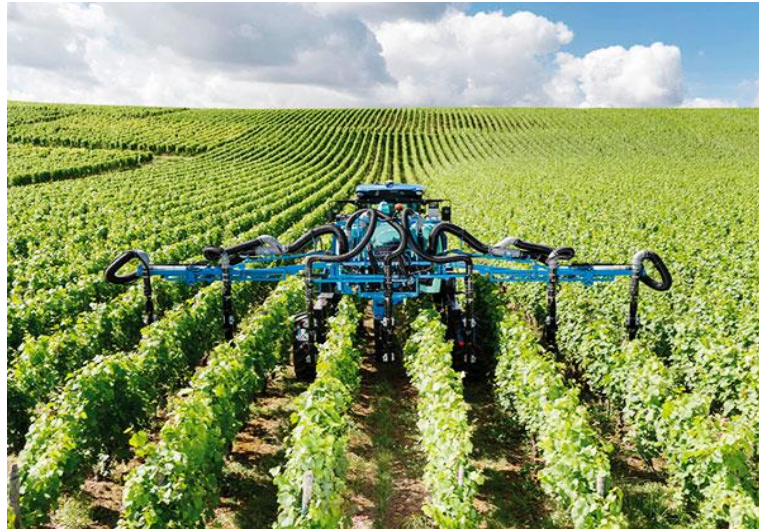
Figure 6. Sprayer with adjustable nozzles