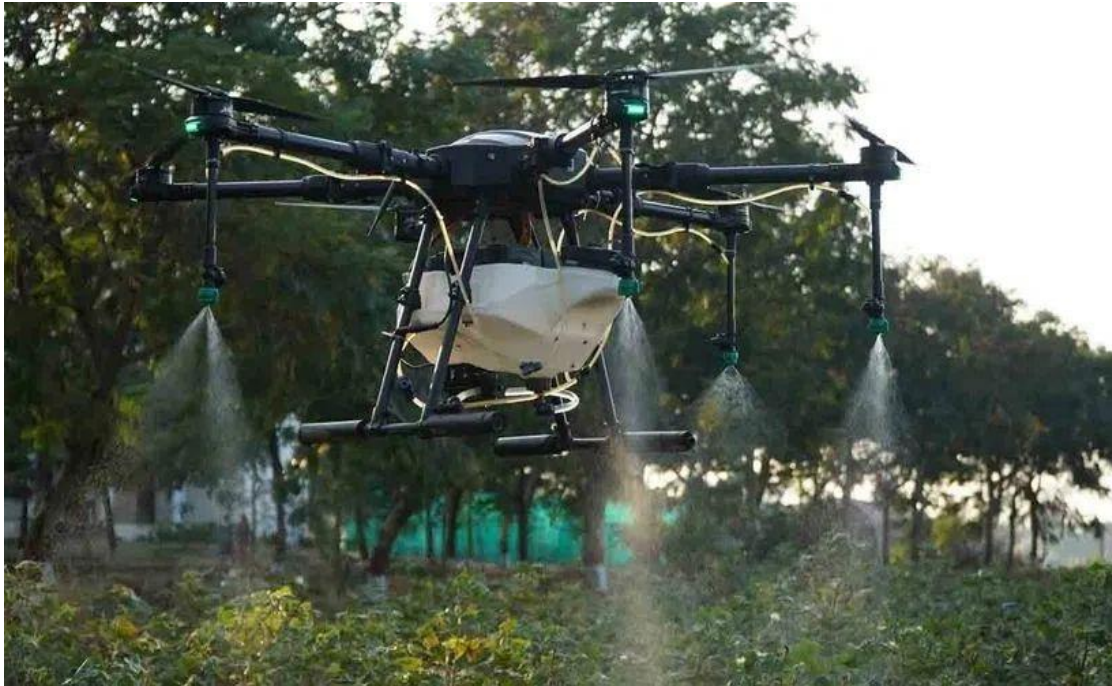
Figure 11. Drone Sprayer