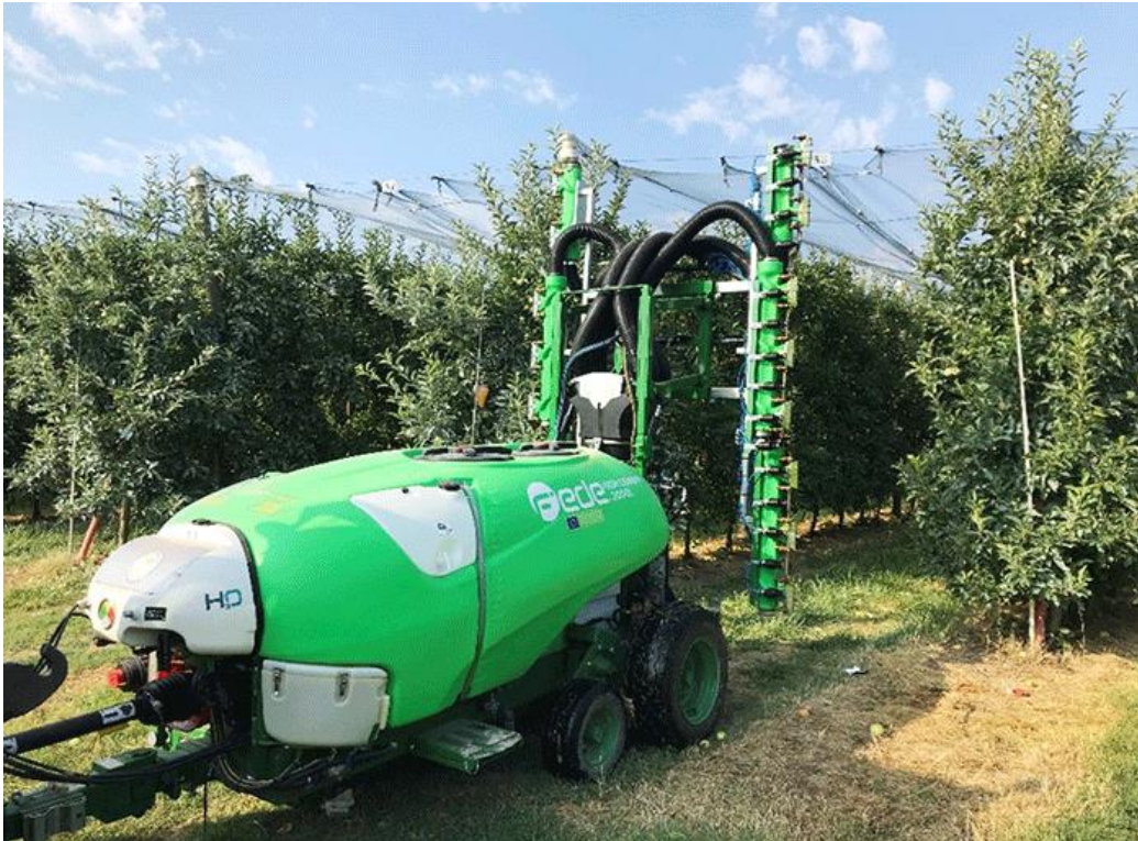
Figure 10. Electrostatic sprayer