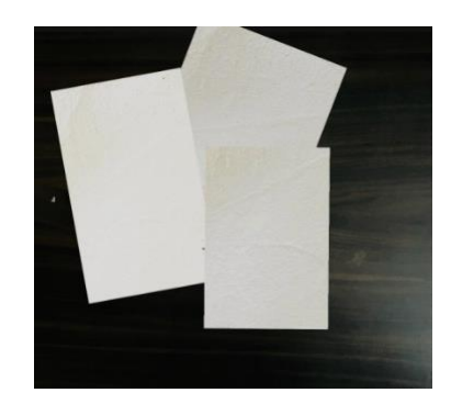
Figure 1 Handcrafted Paper from Rice straw