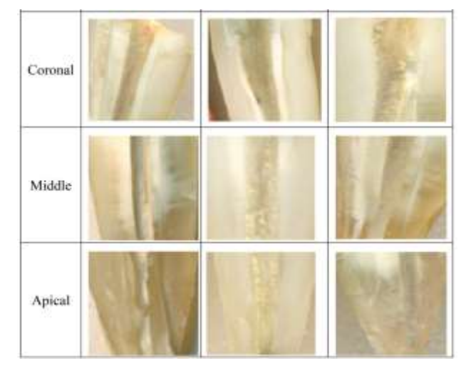
FIGURE 1: shows examples of split teeth to examine the remaining debris in Coronal, middle and apical third of the canal. The examination is done via stereomicroscope and the area of debris noted is calculated in the ImageJ software.

The figure 1 shows examples of split teeth to examine the remaining debris in Coronal, middle and apical third of the canal. The examination is done via stereomicroscope and the area of debris noted is calculated in the ImageJ software.