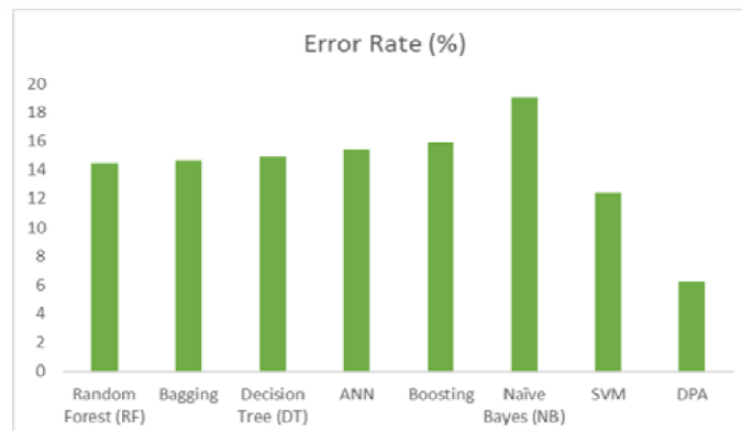
Figure 3. Error-Rate comparison

Further, proposed DPA is differentiated and Decision Stump, Hoeffding Tree, Naïve Bayes and Simple Logistic Algorithms using the data accumulated from IOT Diabetes Sensors to the extent accuracy, and the results are shown in Table 5. Here, we used WEKA contraption for finding the precisions of existing estimations.