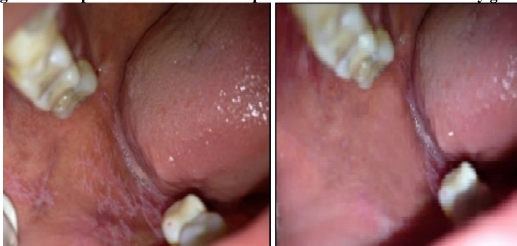
Figure 2 A 46-year-old female patient with oral lichen planus. The image shows the patient's condition before and after undergoing 4-week therapy with Vitamin D derivative.

The average and standard deviation values for the difference in MMP-9 ( \mu\text{g/L} ) levels between pre-treatment and post-treatment in group A were -2.13(\pm 0.87) , whereas the average and standard deviation values of MMP-9 ( \mu\text{g/L} ) levels in group B were -1.46(\pm 0.60) . The average discrepancy between the two groups (Vitamin D derivative and retinoids) was -0.68 , with a standard error of 0.26 . Thus, there was a statistically significant difference between the groups treated with Vitamin D derivative and retinoids in terms of the reduction in MMP-9 level before and after treatment, with a p-value of 0.01405 . These findings are illustrated in Figure 3. Furthermore, a non-parametric Mann-Whitney test was employed to verify the disparity in MMP-9 levels (before and after therapy) between the two groups.