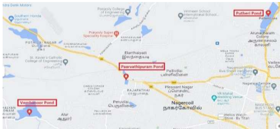
Fig.1. Location Map of Study Area

Vembanoor is a small Village/hamlet in Rajakkamangalam Block in Kanyakumari District of Tamil Nadu State, India (Fig.1) .It is located 8 KM towards west from District headquarters Nagercoil, 4 KM from Rajakkamangalam, 736 KM from State capital Chennai. Parvathipuram pond is located on NH 66 about five KM from Nagercoil central and 60 km from Thiruvananthapuram(Fig). Putheri Lake receives water from a canal outlet of Pechiparai Dam meant for irrigation. Much local agricultural runoff is also received by this lake . It partially fulfills drinking water needs of the locals, is used for irrigation and also helps to recharge the ground water aquifer (Esakkimuthu et al. 2015).