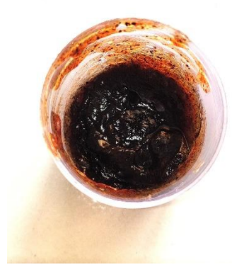
Figure3: Cold Cream Preparation using Houttuynia Cordata leaves and Babchi seeds