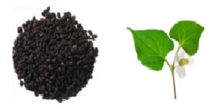
Figure 1: Houttuynia Cordata leaves and Babchi seed

There is a very important plant called Psoralea corylifolia that is used in many traditional medicines to treat a lot of different illnesses. The plant babchi, also known as Psoralea corylifolia, is used in Chinese, Indian, and Tamil Siddha treatment. It can fight free radicals, kill fungi, fight sadness, fight tumors, and change the immune system. Babchi seeds contain a precious oil.5.5% terpenoid oil that doesn't evaporate easily, 8.6% dark brown resin, 10.0% brown steady oil, raffinose, coumarin compounds, albumin, sugar, 7.5% ash, and a small amount of manganese. Products with psoralen and is psoralen have healing power. They are treated for Bars Leukoderma, psoriasis, leprosy, pityriasis, pharyngitis, and worms in the guts [4-7].