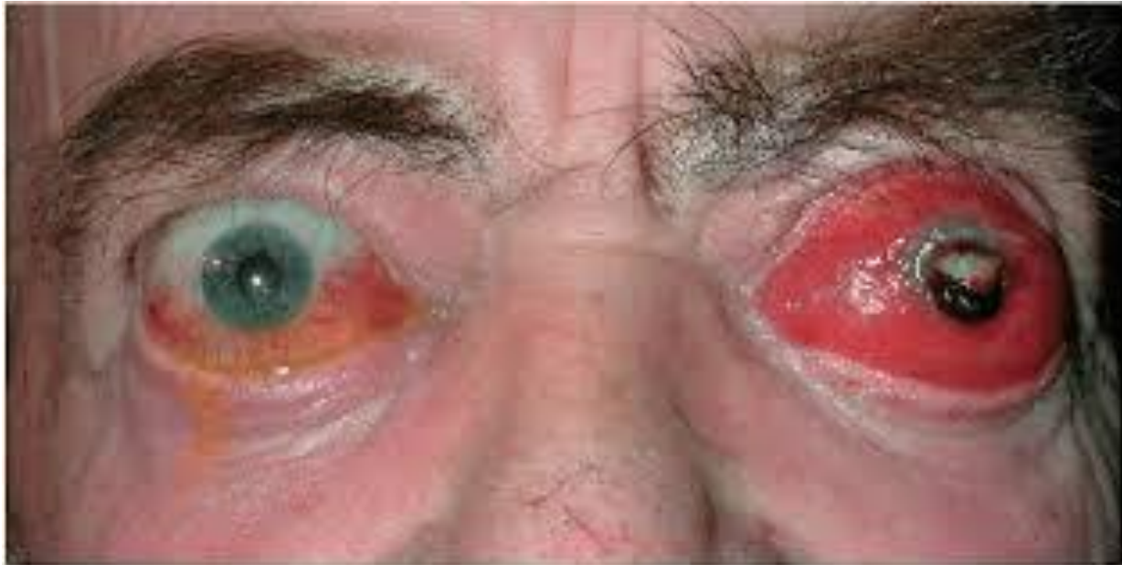
Figure 2: Orbitopathy of the thyroid

which has an incidence that ranges between fifty and sixty per cent in the office of an orbit surgeon where the patient is being treated. It is also known as Graves ophthalmopathy because of its association with Graves' disease, which is considered the most common extrathyroidal manifestation of this disease. However, it can occur in patients who have no history of hyperthyroidism, either in the past or in the present, as well as in patients who have hypothyroidism and Hashimoto's thyroiditis.