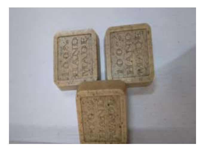
Figure 2: Coffee soap with 5% of coffee powder of total weight of soap