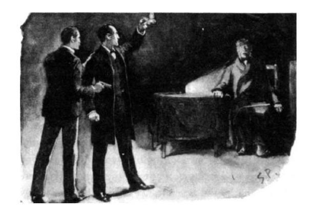
Figure 5. The picture showing the end of the story