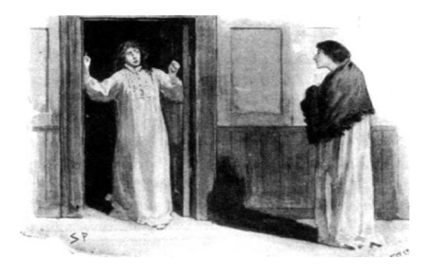
Figure 2. Another picture from the story

In the continuation of the story, these students put another picture in front of her friends and opened it for discussion.