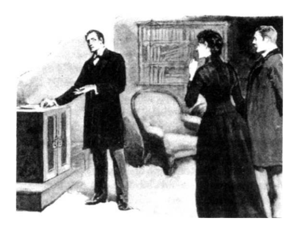
Figure 4. A picture in which they discuss.

The next picture opened new discussions, and the students tried to insert this picture somewhere inside the story.