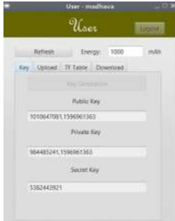
Fig. 3. Key Generation Page