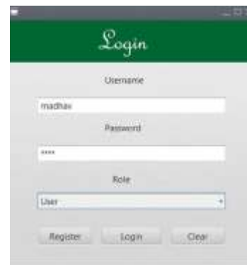
Fig. 2. Login Page