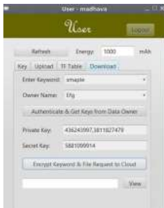
Fig. 5. Download Page