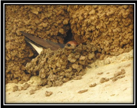
Fig. 6. Retort nest construction process by Swallow