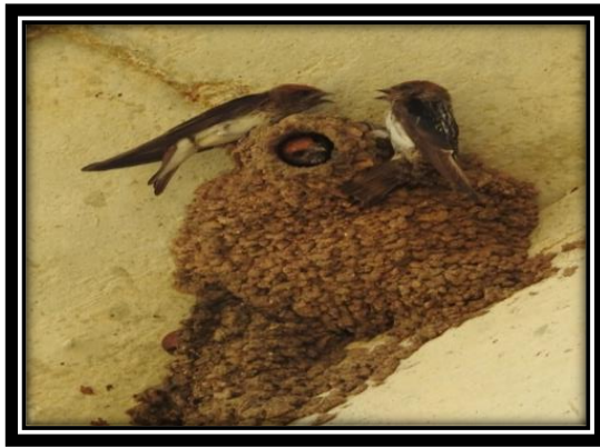
Fig. 5. Parental care by (Male and Female Swallow).