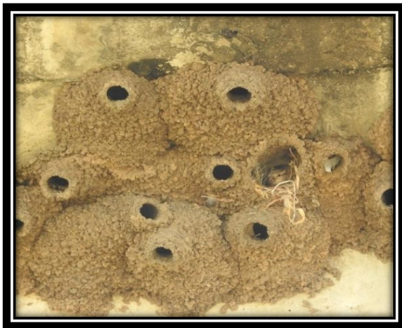
Fig. 10. Nest modification by nest parasite Passer domesticus