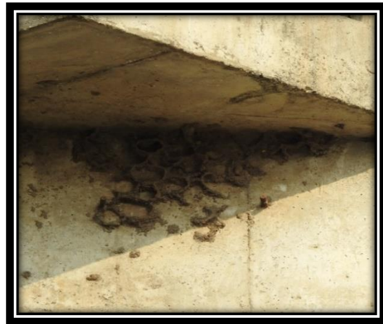
Fig. 9. Nest destruction/abandoned site.