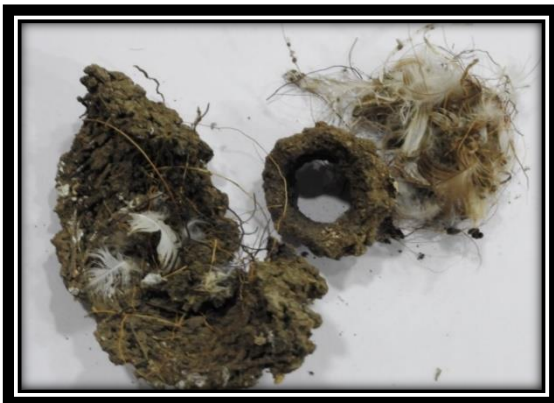
Fig. 4. Nest materials.