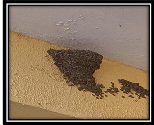
Fig. 7. Isolated Pocket nest.