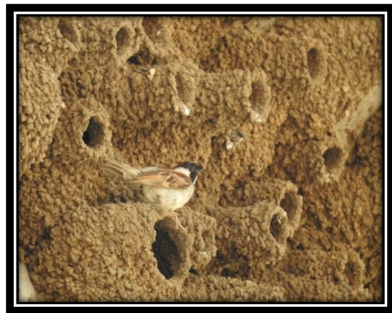
Fig. 10. Nest parasite Passer domesticus at nesting site.