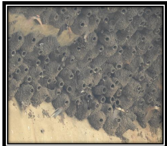
Fig. 2 (b). Wire-tailed swallow Nests at Fig. 2(a).