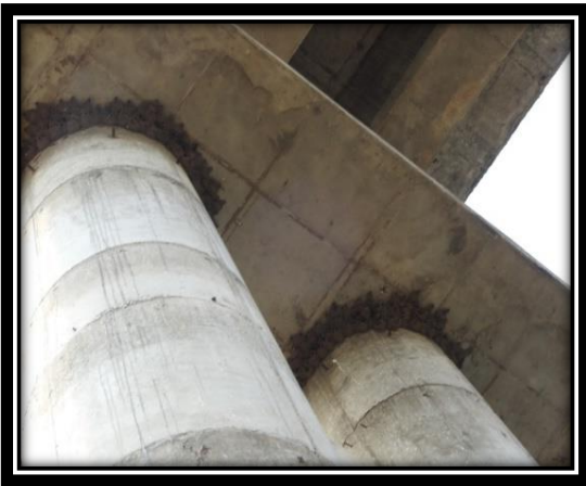
Fig. 3 (a). Nest location at Railway Bridge-Purna Railway Station.