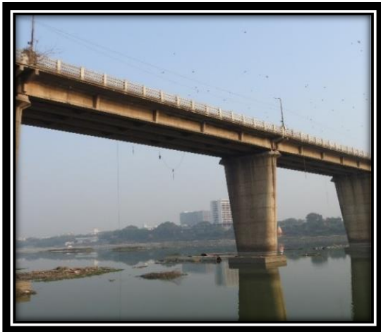
Fig. 2 (a). Nest location Godavari River Bridge, Nanded city.