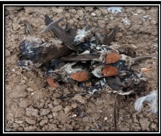
Fig. 8. Chick and adult mortality of Swallow at nest site.