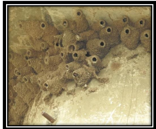
Fig. 3 (b). Wire-tailed swallow Nests at Fig. 3(a).