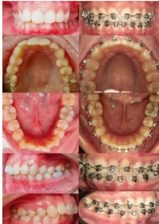
Figure 2. Intraoral photographs before and after treatment

The panoramic radiographs before and after treatment can be seen in Figure 3. The lateral cephalometric radiographs before and after orthodontic treatment can be seen in Figure 4. Evaluation of the results of the panoramic radiograph examination before and after treatment obtained relatively parallel tooth roots.