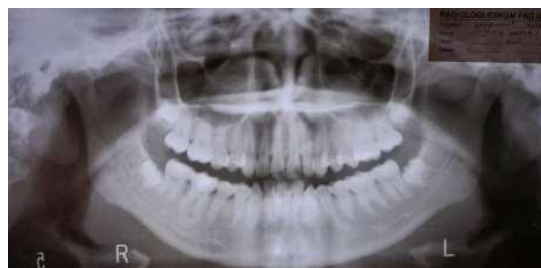
Figure 3. Panoramic radiographs of the patient before and after treatment

The panoramic radiographs before and after treatment can be seen in Figure 3. The lateral cephalometric radiographs before and after orthodontic treatment can be seen in Figure 4. Evaluation of the results of the panoramic radiograph examination before and after treatment obtained relatively parallel tooth roots.