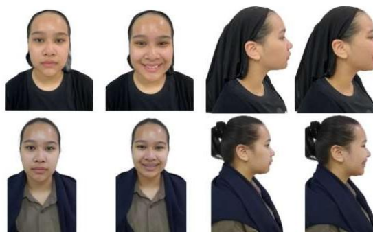
Figure 1. Extraoral photos before and after treatment

There was a 2 mm improvement in overjet with an initial overjet of +4 mm and a final overjet of +2 mm. There was a 3 mm overbite improvement with an initial overbite of +5 mm and a final overbite of + 2mm. The upper and lower dental arch midlines were in line with the facial midline. Inclination and angulation of the teeth are normal with the right and left canine relationship being class I, the molar relationship can be maintained to remain class I. Functional examination obtained canine guidance articulation on right and left lateral movement.