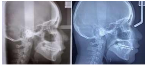
Figure 5. Superimposition of lateral cephalometric radiographs. (A) At the base of the cranium; (B) maxilla and mandible (black color shows pre-treatment cephalometry and blue color shows post-treatment cephalometry).