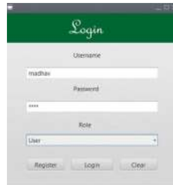
Fig. 2. Login Page