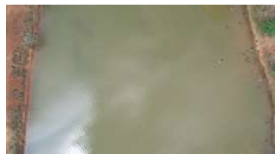
Fig.9. Image Taken by quadcopter