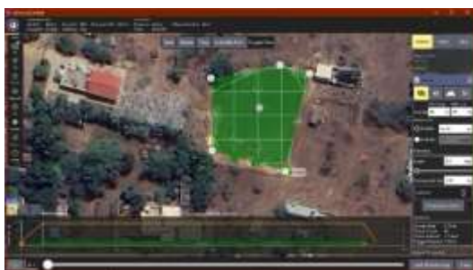
Fig.8. Aerial Mapping Using quadcopter