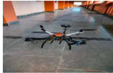
Fig.3. Assembled quadcopter