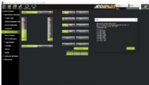
Fig.4. Transmitter Input Response