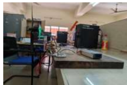
Fig.7. Calculation of thrust using loadcell