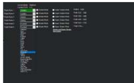
Fig.5. Control Input response