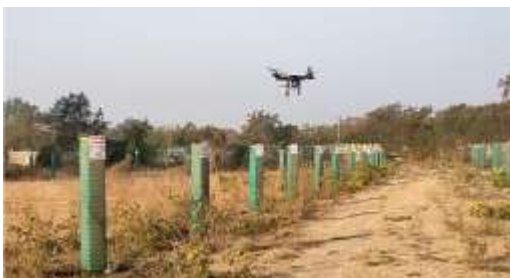
Fig.6. Field Test on quadcopter