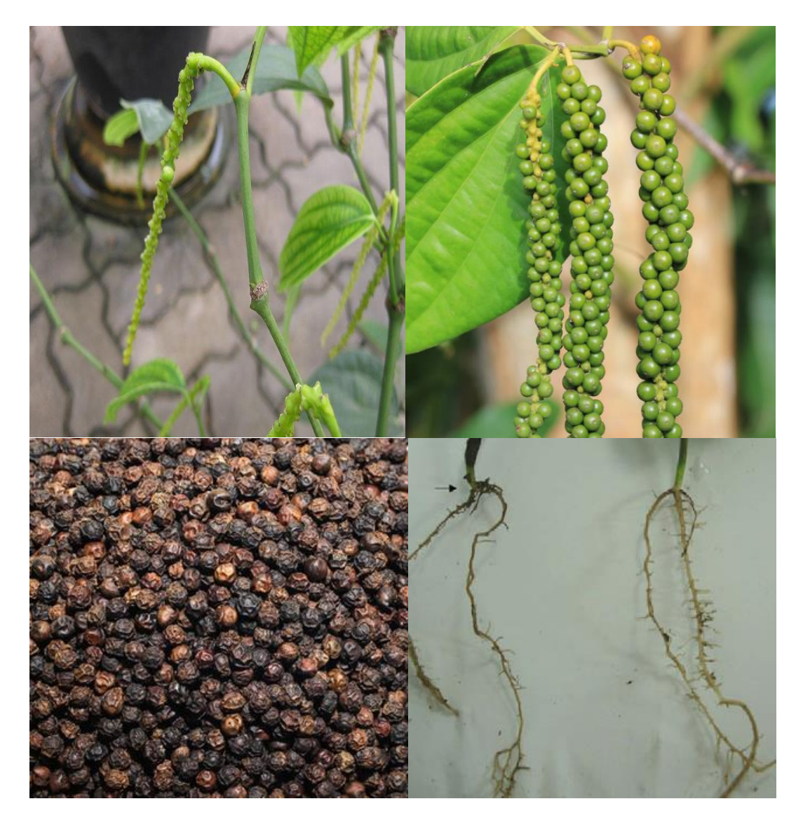
Figure 1: Different parts of Piper nigrum