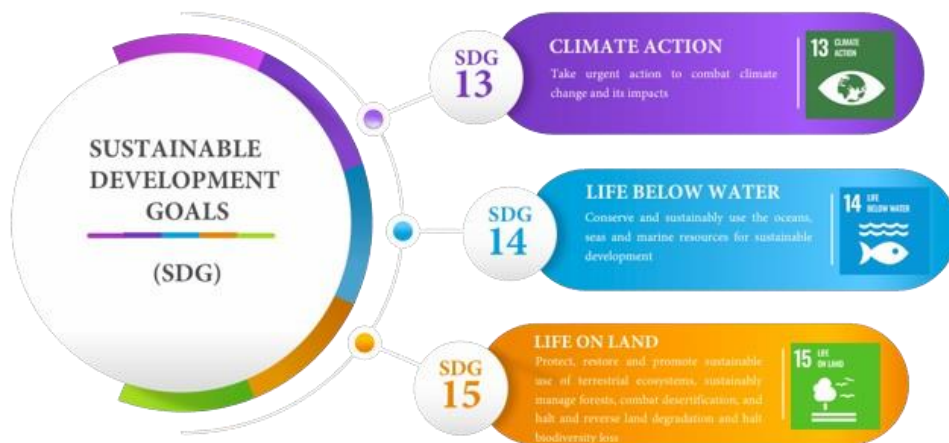
Figure1: SDG’s corresponding towards environmental outcomes

Artificial Intelligence (AI) is becoming increasingly significant in environmental conservation by disrupting traditional methods and enhancing human skills. The Sustainable Development Goals (SDGs) encompass 17 global objectives designed to address various challenges facing humanity. Within these goals, SDGs 13, 14, and 15 specifically focus on environmental sustainability as depicted in Figure 1. SDG 13 aims to combat climate change and its impacts, while SDG 14 targets the conservation and sustainable use of oceans, seas, and marine resources. SDG 15 seeks to protect, restore, and promote the sustainable use of terrestrial ecosystems, forests, and biodiversity. Together, these goals highlight the critical importance of environmental stewardship in achieving sustainable development worldwide.