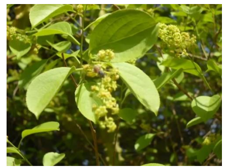
Figure 2: morphology of Celastrus paniculatus

Celastrus paniculatus , also known as black oil plant or intellect tree, is a deciduous climbing shrub belonging to the Celastraceae family. It features slender, wiry stems that twine around support structures as it grows[21]. The leaves are elliptical, glossy green, and arranged alternately along the stems. They are about 5-10 cm in length, with finely toothed margins. The flowers of Celastrus paniculatus are small, greenish-white, and appear in dense clusters (panicles) at the ends of branches. The fruit is a capsule that contains seeds covered with a bright red aril[22].