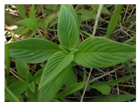
Figure 1: morphology of Spermacoce latifolia

features opposite leaves that are broad, ovate to elliptic, and can grow up to 7 cm long. The leaves are glossy green with prominent veins and smooth edges. Spermacoce latifolia produces small white flowers, clustered at the ends of branches. Each flower has four petals and is surrounded by green sepals[18].