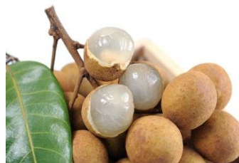
Fig no.1 : Nephelium longan lour fruit

Nephelium Longan peel extracts have been shown to possess antioxidant activities by scavenging free radicals in solvent-, aqueous-, and emulsion-based systems (Prasad et al., 2010; Rakariyatham, Liu, et al., 2020; Rakariyatham, Zhou, Rakariyatham, & Shahidi, 2020). Regarding safety evaluation of logan peel extract, Ripa et al. (Ripa, Haque, Bulbul, Begum, & Habib, 2012) performed experiments in Long-Evan rats and demonstrated no behavioral change or mortality during 48 h after oral administration of the extract up to the dose of 1.6 g/kg. China, the main longan-producing country in the world, produced about 1,900 thousand tonnes of longan in 2015–2017. The current study was undertaken to investigate the anticonvulsant effects of ethanolic extracts of the peels of N. longan .