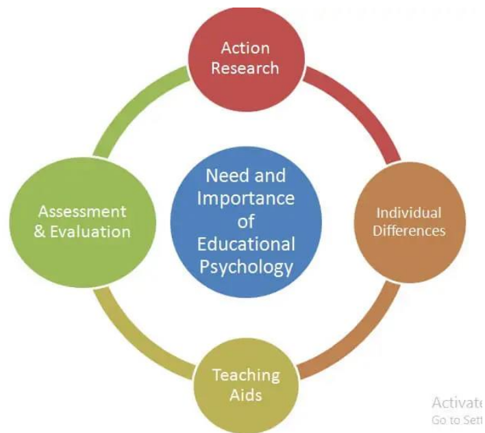
Fig.3: Need and Importance of Educational Psychology