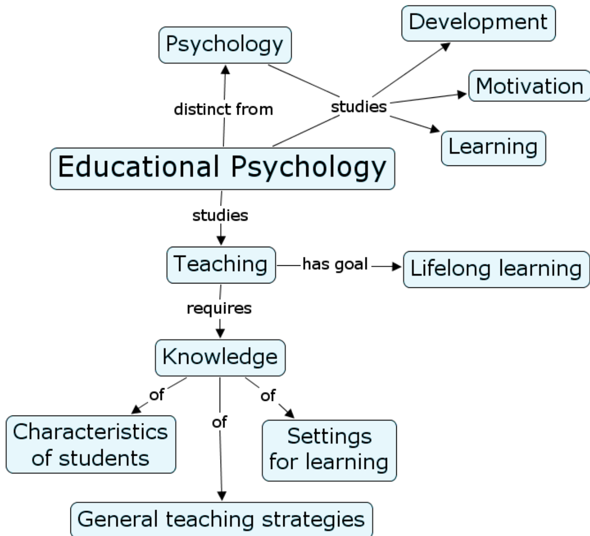
Fig.2: Educational Psychology