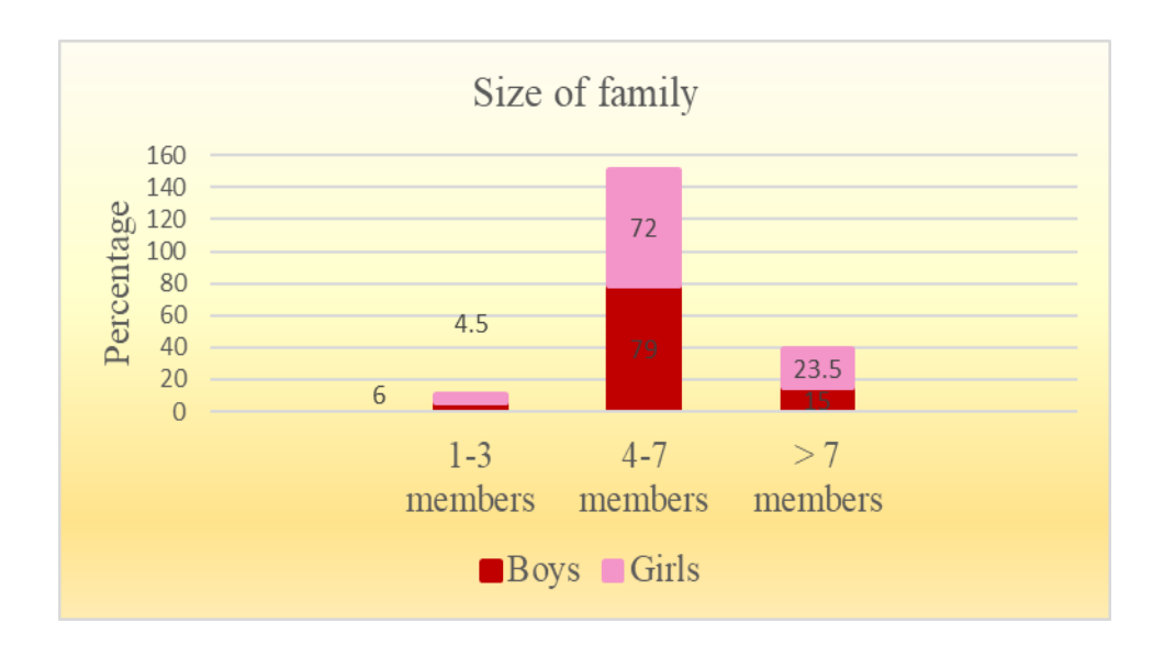
Figure 3: Distribution of Anganwadi children based on size of family

Figure 3 showed that the majority of children (girls: 72.0% and boys: 79.0%) had families with four to seven members, with the exception of 15.0% of boys and 23.5% of girls, who had families with more than seven members. Less than 10% of children (girls: 4.5%, boys: 6%) had a family size of three to five members. This is a very tiny percentage. The children of the Yanadi tribe discovered that mothers can leave their children to marry another person and abandon their family. As a result, while not all of the children in the family are born to the same lady, they are all born to the same father. The numbers show the gender distribution of children based on family size, indicating that boys and girls had similar family sizes.