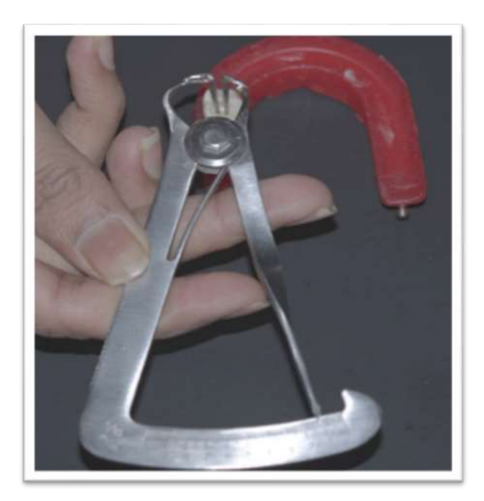
Figure 3: Figure representing the working methodology of the novel endodontic caliper for making the interorificial measurements in the given samples

Table 1 represents the mean value and standard deviation for both the interventions carried on.