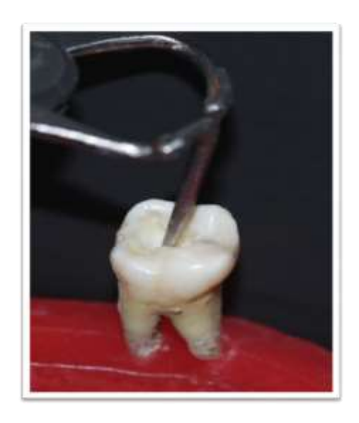
Figure 1: Figure representing the modified prong extensions on the novel endodontic caliper that aids in measurement of interorificial distance

Figure 2 represents a section of the CBCT slice used for CBCT analysis in order to appreciate the canal morphology and measure the interorificial distance.