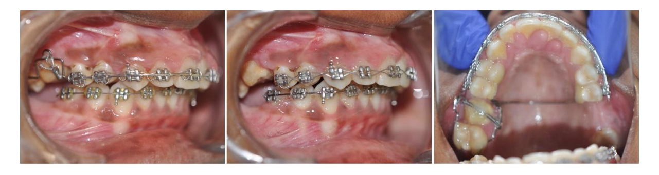
FIGURE 4: Dr. Toshniwal's (NTRDC) intrusion arch

Treatment started with the bonding of MBT brackets (0.022 \times 0.028'') , progressing from a 0.014'' NiTi to 0.019 \times 0.025'' SS wire for alignment (Figure 5). The appliance of choice for intrusion of upper right second molar (17) was a modification of Dr. Toshniwal's Intrusion arch<sup>1</sup> (Figure 4.). Light force was applied for 6 months for intrusion of 17 approximately upto 90gms to avoid root resorption.