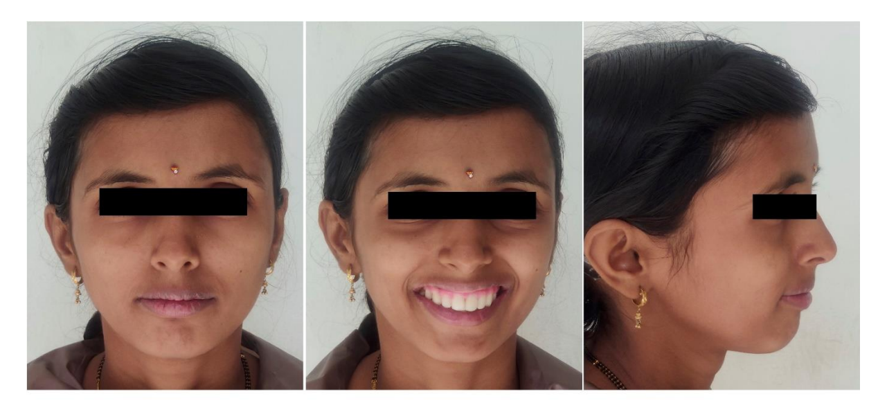
FIGURE 10: Follow up extra oral photographs

Two year Follow up records showing maintained results without any sign of relapse are shown in Figure 10,11.