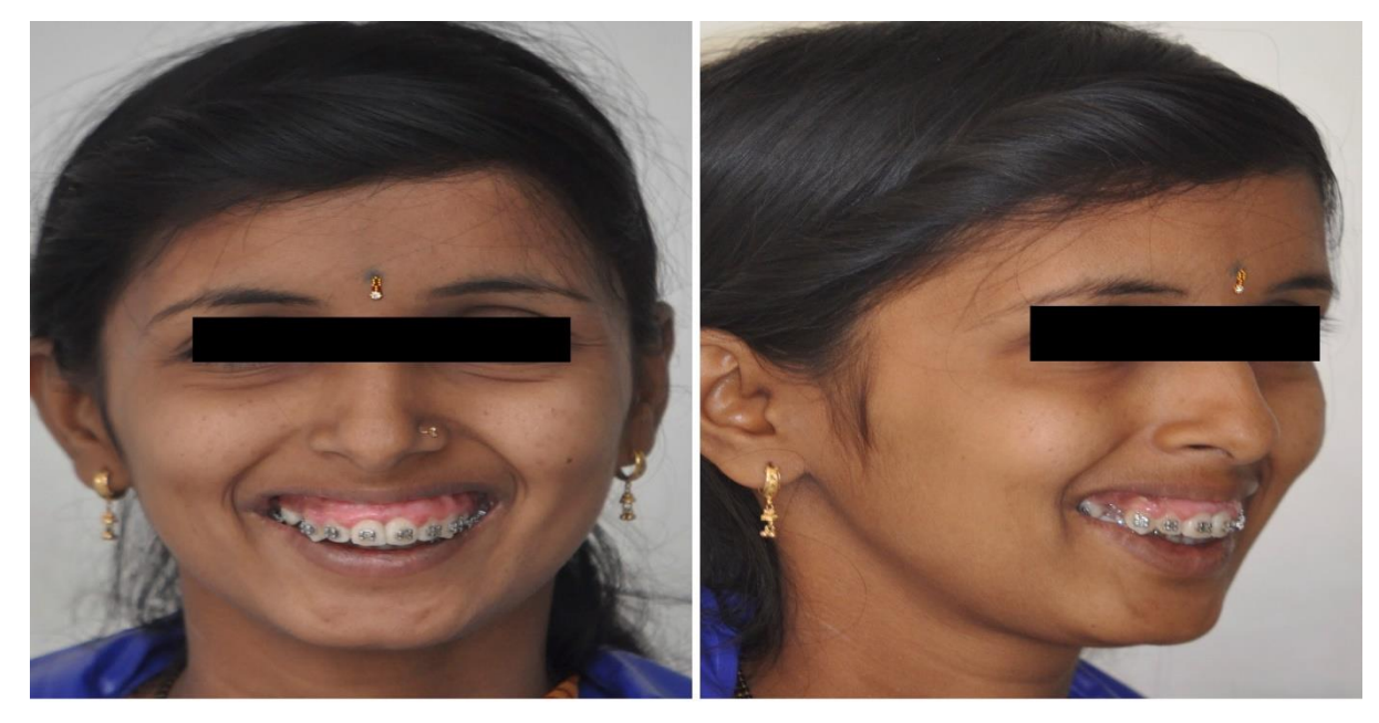
FIGURE 5: Treatment progress- Extra oral photographs