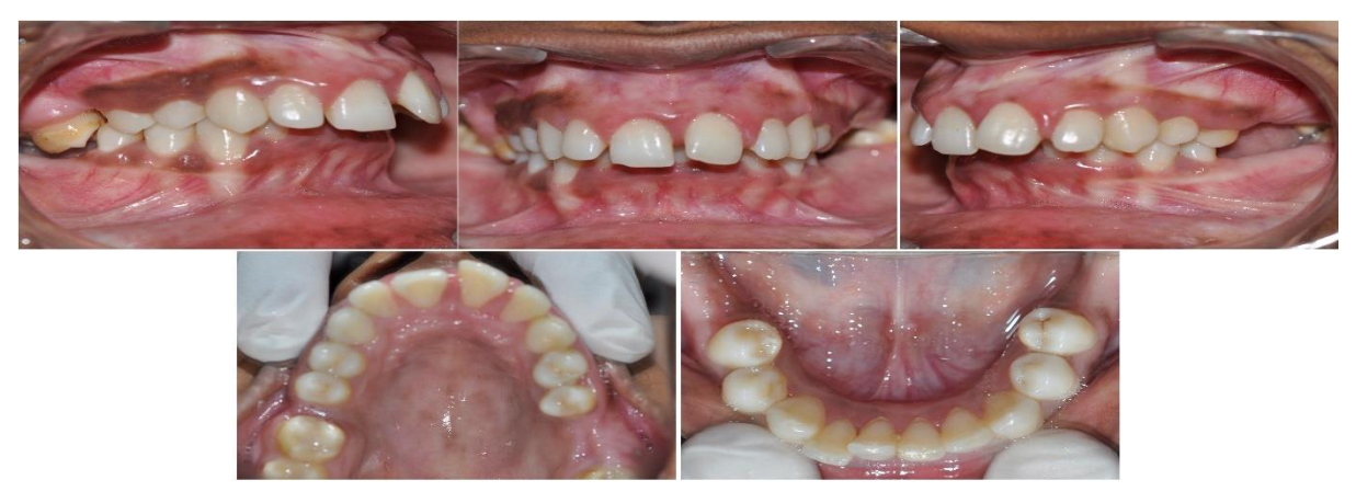
FIGURE 2: Pre treatment intra-oral photographs.

Lateral Cephalogram showed skeletal class II, proclined anterior teeth. Panoramic radiograph showed missing 16,26,27,36,37,46,47 and extrusion and mesial tipping of 17. (Figure 3.)