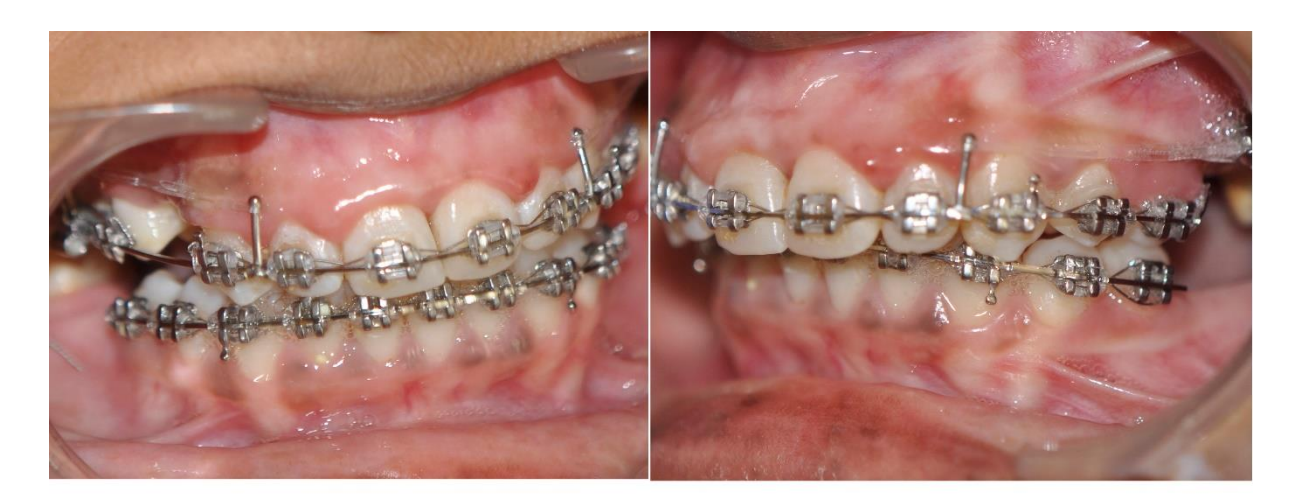
FIGURE 6 : Treatment progress- IZC and long lever arms for retraction.

Here in this multidisciplinary case, dental element intrusion and arch alignment were achieved through orthodontic treatment. The main goal of this procedure was to provide space for prosthetic replacement which was almost impossible without orthodontic treatment.