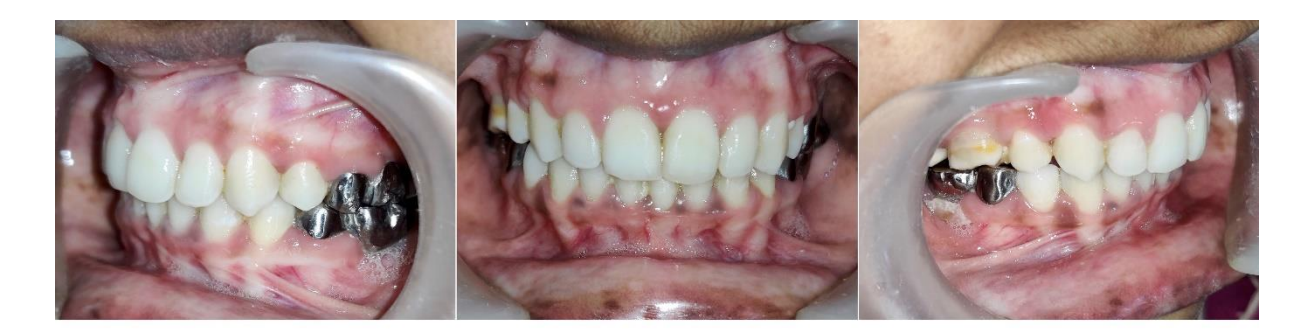
FIGURE 11: Follow up intra oral photographs