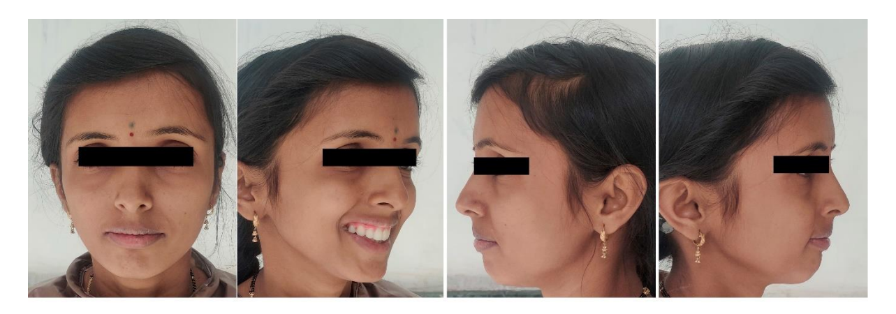
FIGURE 7: Post treatment Extra oral photographs