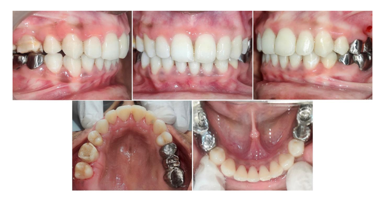
FIGURE 8: Post treatment intra oral photographs