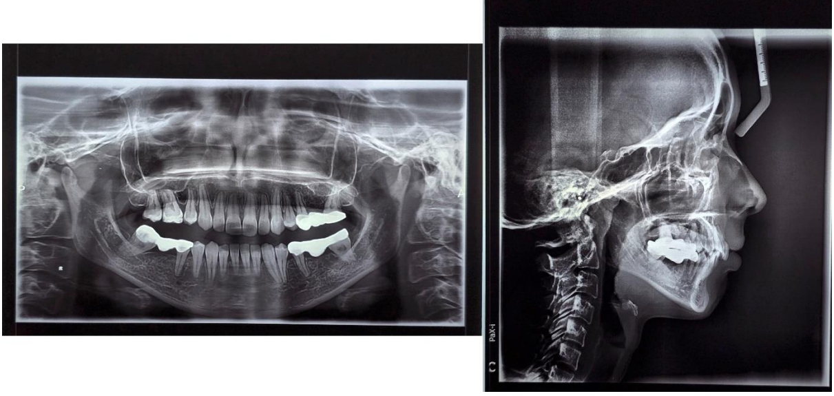
FIGURE 9: Post treatment radiographs