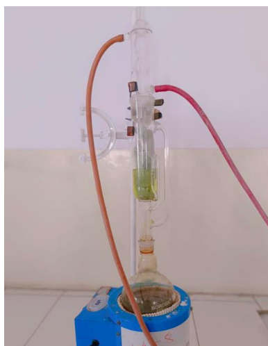
Fig 3. Soxhlet extraction

A Litchi Chinensis extract was prepared using shade-dried leaves. The leaves were weighed 100 gram and then coarsely powdered [25,26,27] The powder was subjected to Soxhlet extraction using hydroethanolic as the solvent for a duration of 3 days. In the Soxhlet apparatus, 500 ml of 70/30% hydroethanolic was added to the powdered extract [28,29,30]. The extract was continuously extracted and collected in a round-bottom flask. Subsequently, the collected extract was concentrated using a Rota Vapor apparatus until approximately 25 ml remained in the round-bottom flask [31,32]