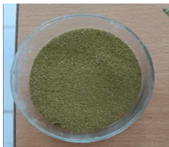
Fig 2. Litchi Chinensis powder