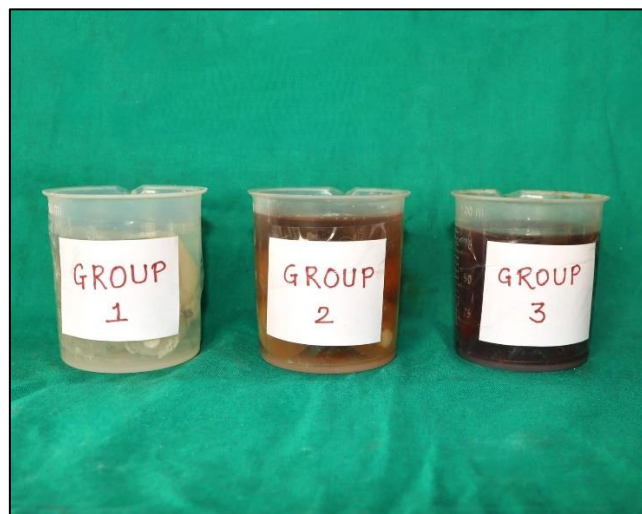
Figure 3: Groups of study Group 1: Samples dipped in artificial saliva Group 2: Samples dipped in alcohol solution Group 3: Samples dipped in ghutka solution

Twenty-four hours after storage in each solution, the debonding procedure was carried out at the Universal Testing Machine (Unitest 10) [Figure 4] and the shear bond strength was calculated using the formula: