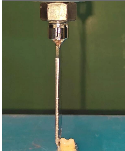
Figure 4: Debonding procedure carried out at the universal testing machine