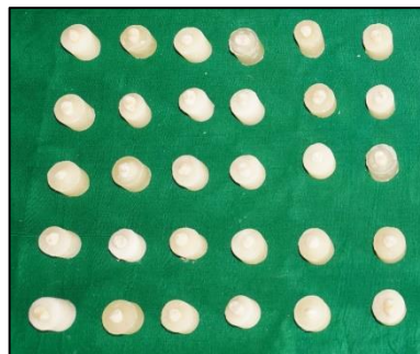
Figure 1: Study samples

Buccal surface of all the teeth were acid-etched with 37% orthophosphoric acid for 30 seconds and washed for 20 seconds and air dried. After the appearance of frosty white surface, primer (3M Transbond, California) was applied on etched surface and cured with light cure and orthodontic MBT metal brackets (3M Unitek Gemini) were bonded with composite (3M Transbond XT Unitek) and it was light cured with light-emitting diode light device [Figure 2]