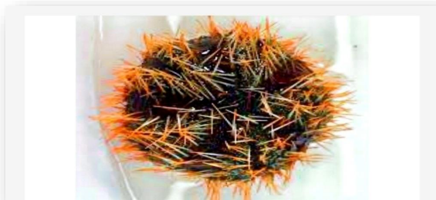
Figure 3: The collected specimen of Tripneustes gratilla from Tobruk, Libyan waters

Lovenia cordiformis the specimen had the typical shape of heart urchins, with length (33.9 mm) than width (18.2 mm) and it is similar to irregular specimen that collected on Colombia (Muñoz et al.,2016),(Figure,3). that is classified into Class Echinoidea, Order Spatangoida, Suborder Micrasterina, Family Lovenidae, Genus Lovenia , Lovenia cordiformis Agassiz, 1872. The oral surface, is the bottom side of the urchin, is flattened, while the aboral surface, or the top side, is more convex, contributing to the overall heart shape. The spines are extensions of the test plates and are covered with small, tube-like structures called pedicellariae, the spines clean and free from debris. The spines vary in size and densely distributed over the surface of the test. The body color of Lovenia cordiformis , the heart urchin, is reddish to purplish.