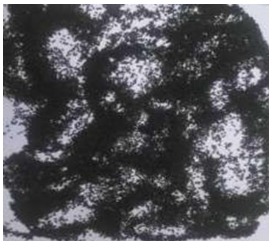
Fig-1: Nigella Sativa seeds

The Nigella sativa L. seeds were purchased from a local market in Chengal Pattu District, Tamil Nadu, India. To remove the clinging contaminants, the black seeds were thoroughly rinsed with plenty of water. To prepare the extract, only the clean seeds were used..