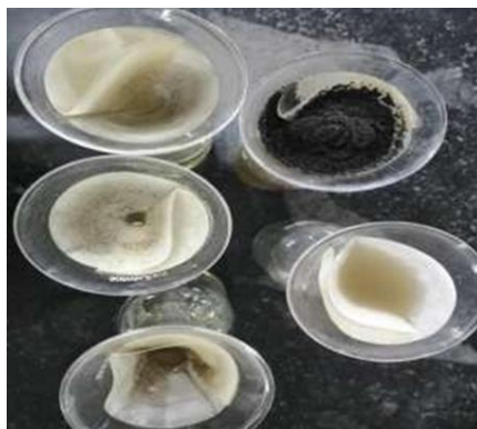
Fig-3: Extraction of solvents using Whatman No .1 filter paper