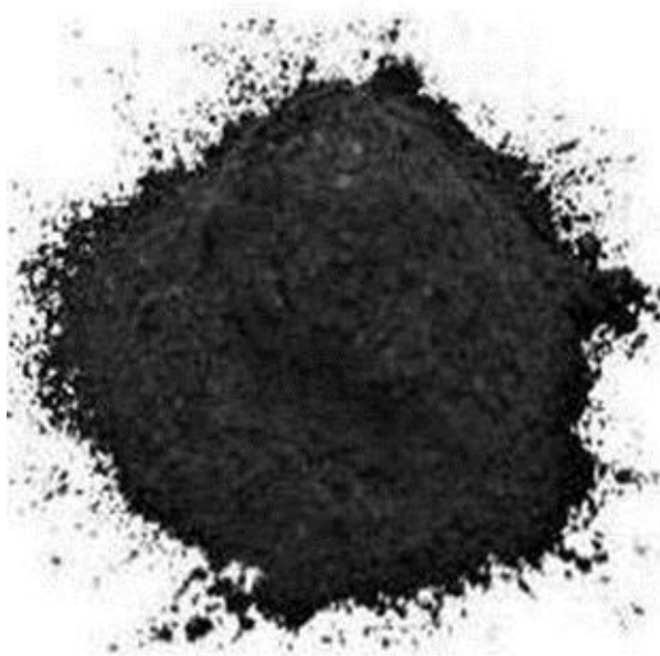
Fig-2: Nigella sativa Seed Powder