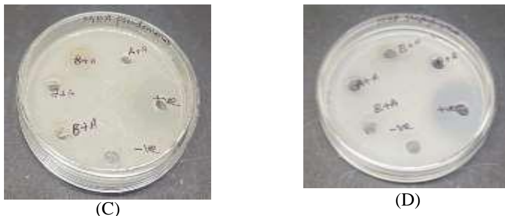
Fig – 6 : Inhibitory effect of solvent extracts of Nigella sativa seeds

A) Anti-bacterial activity against E.coli B) Antibacterial activity against Enterobacter C) Antibacterial activity against Pseudomonas aeruginosa D)Antibacterial activity against Staphylococcus aureus