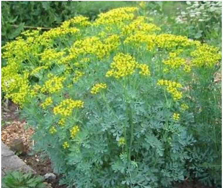
Fig 2: Ruta graveolens