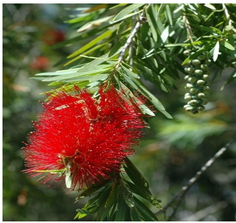
Fig 1: Melaleuca viminalis