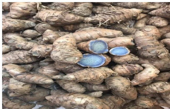
Figure 2: Rhizomes of Curcuma caesia