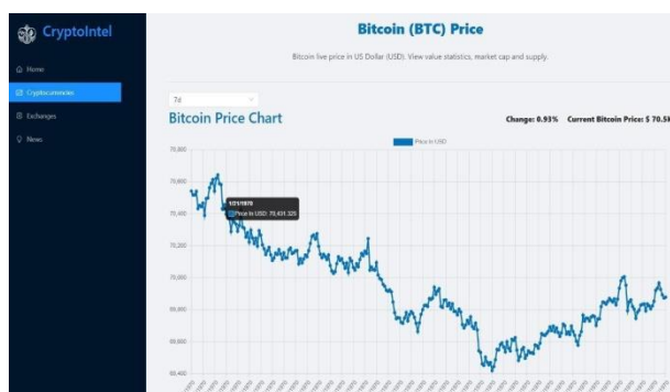
Fig.2.2: Coin Price Chart

Coin Price Chart Page: The Coin Price Chart page within CryptoIntel offers users a comprehensive and dynamic tool for analyzing the historical performance of individual cryptocurrencies. This page serves as a hub for users seeking to delve deeper into the price movements and trends of specific digital assets, enabling them to make informed investment decisions.