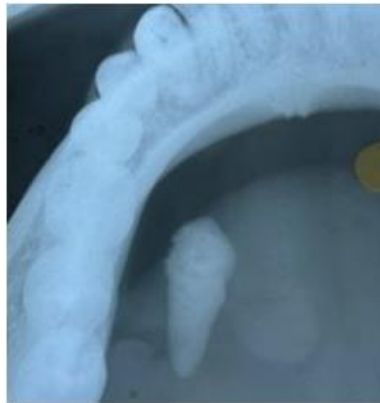
Fig. 1: Preoperative occlusal

In our case, harnessing the 3-D capabilities of CBCT facilitated an accurate diagnosis, effectively differentiating the clinical diagnosis from potential alternatives. This informed a meticulously planned treatment approach, resulting in successful treatment outcomes without any postoperative complications. CBCT's transformative role in guiding precise diagnoses and treatment strategies underscores its invaluable contribution to enhancing oral healthcare standards. 10