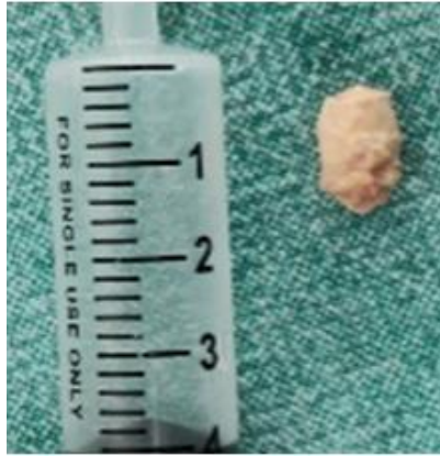
Fig. 4.: macroscopic image