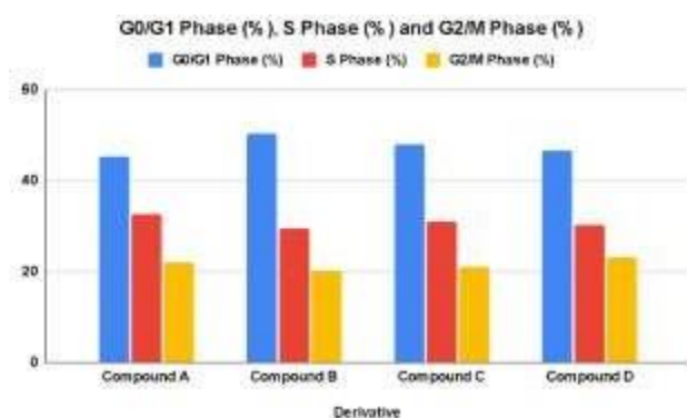
Fig. 3: Cell Cycle Arrest Data for Benzothiazole Aniline Derivatives

Figure 2 shows the selectivity indices (SI) of four drugs in relation to the IC50 values in normal cells for the breast cancer (MCF-7), lung cancer (A549), and liver cancer (HepG2) cell lines. The capacity of a chemical to target cancer cells while sparing healthy cells is measured by its selectivity index. Among all cancer cell lines, Compound B has the highest selectivity index (3.2 for MCF-7, 2.4 for A549, and 2.1 for HepG2), suggesting the optimal trade-off between safety and efficacy. In comparison to the other chemicals, Compound A exhibits the lowest selectivity index, indicating a lower level of selectivity and increased toxicity towards normal cells.