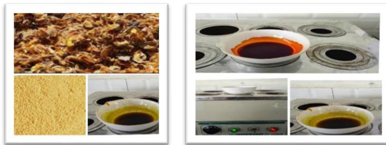
Figure. 2 Drying of Drug Figure.3.Preparation of Extract