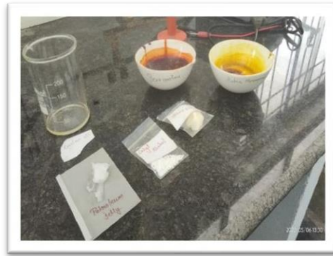
Figure.1 Ingredients Used in Herbal Lipsticks